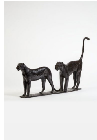
REMBRANDT BUGATTI (1884-1916) Petits léopards l'un derrière l'autre bronze with brown patina H: 39.2 cm. L: 62 cm Drawn up in circa 1912; this proof was poured between 1925 and 1931 as part of a ten-copy edition Estimate: €250,000 – 350,000