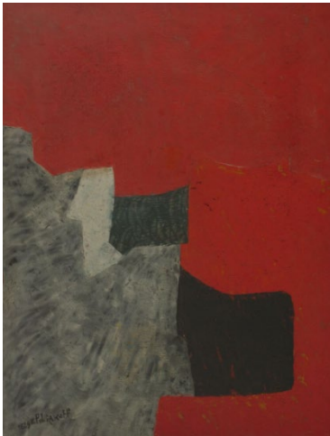
SERGE POLIAKOFF (1900-1969) Rouge et gris, 1957 oil on panel 116 x 88.5 cm Estimate: €180,000 – 250,000