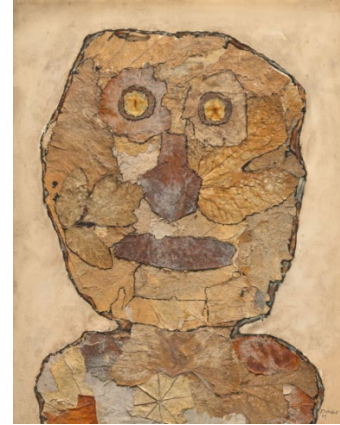
JEAN DUBUFFET (1901-1985) Regard limpide, 1959 collage of botanical elements 62 x 48 cm Estimate: €250,000 – 350,000