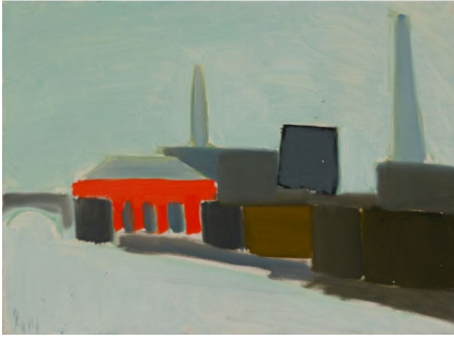
NICOLAS DE STAËL (1914-1955) Quai de Grenelle, 1954 oil on canvas 60 x 81 cm Estimate: €600,000 – 800,000