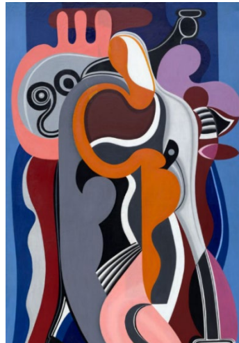
AUGUSTE HERBIN (1882-1960) Untitled, 1928 oil on canvas 195.3 x 114.3 cm Estimate: €150,000 – 250,000