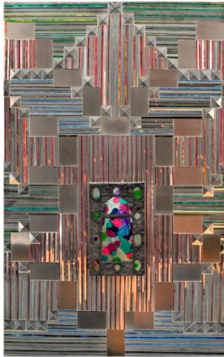
MONIR SHAHROUDY FARMANFARMAIAN (1922, QAZVIN - 2019, TEHRAN) Untitled , 1974 (Estimate US$80,000-120,000)

DUBAI – Christie's announce the second edition of its Dubai online platform, Modern and Contemporary Art – Dubai , live for bidding from 9 – 23 May, celebrating cross-cultural dialogues between modern and contemporary artists from the Middle East and the wider Global South, reflecting the region's diverse and ever-evolving cultural environment. In addition to works of art from the Middle East the demand for a wider representation of artists by collectors from the region has reshaped the sale to encompass artists from Africa, Latin America and South Asia. Works included span painting, sculpture, photography and works on paper from the 1950s - 2020s. The sale comprises approximately 90 artworks by artists from 20 countries, including Algeria, Benin, Colombia, Egypt, Ghana, Iran, Iraq, Kuwait, Lebanon, Morocco, Palestine, Saudi Arabia, Sudan, Syria, Trinidad, Tunisia, Turkey and the UAE.