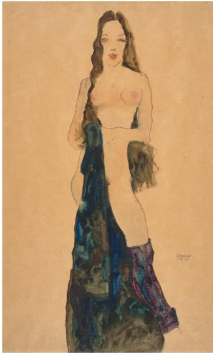
EGON SCHIELE (1890-1918) Stehender Akt mit Draperietuch gouache, watercolor and pencil on paper 22 x 13¾ in. (56.7 x 35 cm.) Executed in 1911 Estimate: $1,200,000-1,800,000