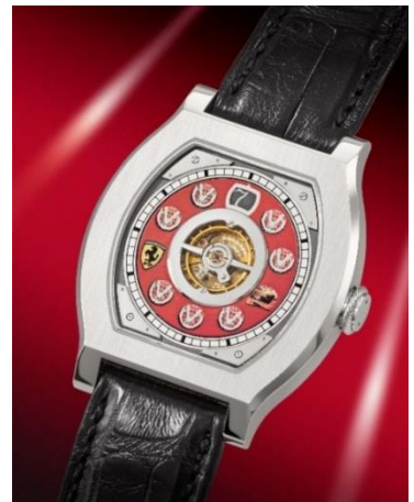
LEFT: AUDEMARS PIGUET, ROYAL OAK CHRONOGRAPH MODEL, REF. 25960BC, NO. E73509, CIRCA 2003 MIDDLE: FULL SET OF 5 F.P. JOURNE RUTHENIUM WATCHES 92/99 SOLD INDIVIDUALLY RIGHT: F.P. JOURNE, INVENIT ET FECIT, PIECE UNIQUE, VAGABONDAGE 1 MODEL, CIRCA 2004

Geneva – On 13 May, Christie's is thrilled to present for the first time at auction eight unique and very rare watches from the collection of Formula 1 racing legend Michael Schumacher. This historic collection will highlight Christie's live auction of Rare Watches at the Four Seasons Hotel des Bergues in Geneva.