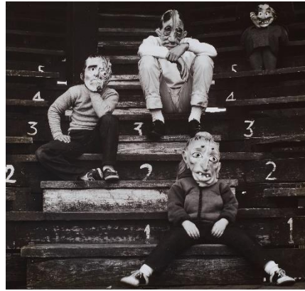
RALPH EUGENE MEATYARD (1925–1972) Romance (N. Of Ambrose Bierce #3), 1962 gelatin silver print, mounted on board Price Realized: $44,100