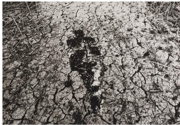
ANA MENDIETA (1948–1985) Untitled (from Silueta series) 1978 gelatin silver print Price Realized: $81,900