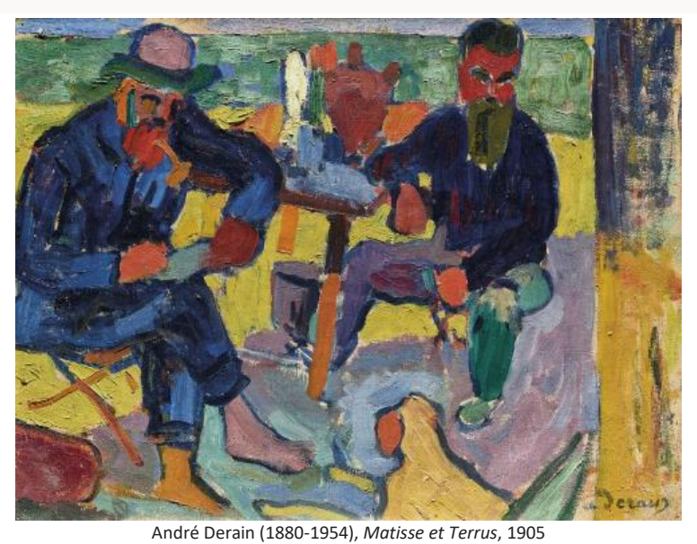
Estimate: €2,000,000 - 3,000,000 Art Impressionniste et Moderne - Œuvres choisies Sale