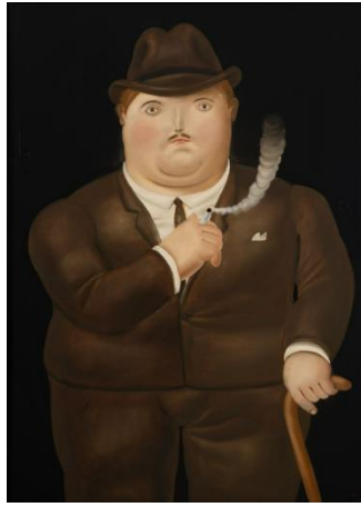
Latin American Art FERNANDO BOTERO (1932-2023) Hombre fumando oil on canvas Painted in 1980. Price Realized: $1,744,000