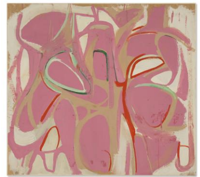
Post-War to Present ELAINE DE KOONING (1918-1989) Untitled (Black Mountain #13) enamel on paper mounted on canvas Executed in 1948. Price Realized: $207,900