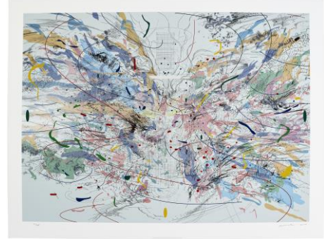
Contemporary Edition: New York Sold by Order of the Board of Trustees of the Minneapolis Institute of Art, to Benefit the Acquisitions Fund JULIE MEHRETU (B. 1970) Entropia (review) lithograph and screenprint in colors, on Arches paper, 2004 Price Realized: $110,880

New York - Friday, March 15, 2024, Christie's New York concluded a successful series of contemporary art live and online sales: Latin American Art live and online , Post-War to Present , and Contemporary Edition: New York . In total, the four sales achieved $39,131,579.