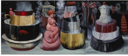
Latin American Art ROBERTO FABELO (b. 1950) Arte culinario oil on canvas Painted in 2018. Price Realized: $630,000