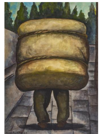
Latin American Art Online DIEGO RIVERA (1886-1957)