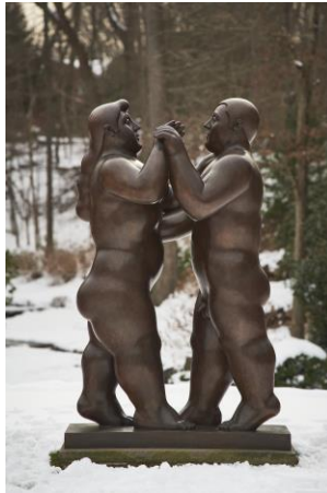
Latin American Art Property from an Important Long Island Collector FERNANDO BOTERO (1932-2023) Dancers Bronze Executed in 2000. Edition two of three. Price Realized: $3,922,000