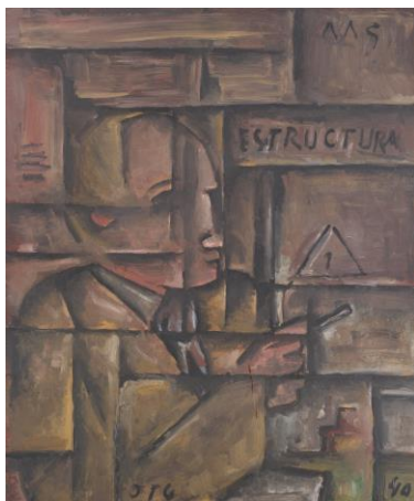
Latin American Art Online Property from a Private American Collection