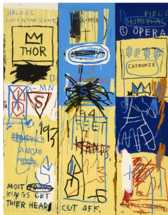
Contemporary Edition: New York JEAN-MICHEL BASQUIAT (1960-1988)