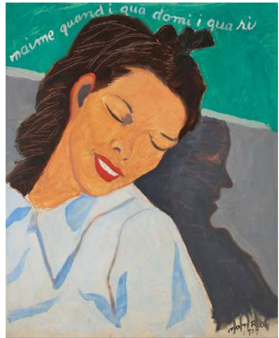
Man Ray (1890-1976), Maime quand i qua domi i qua ri signed, signed with the initials, dated and inscribed 'Man Ray 1937 MR' Maime quand i qua domi i qua ri (lower right) oil, grattage and pencil on panel Painted in 1937 Estimate: €150,000-200,000 | US$170,000-220,000 | £130,000-170,000