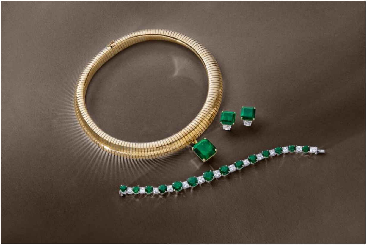
An impressive collection of Bulgari jewels from a Private Collector

NEW YORK – Christie's presents <u>Jewels Online</u>, the first jewelry auction of 2024. The sale will be open for bidding from 11 March and will conclude online on 21 March. The sale features a curated selection of signed jewels, diamonds, and colored gemstones; highlights will be on view from 17-20 March and the exhibition will be open to the public in New York at Christie's Rockefeller Center