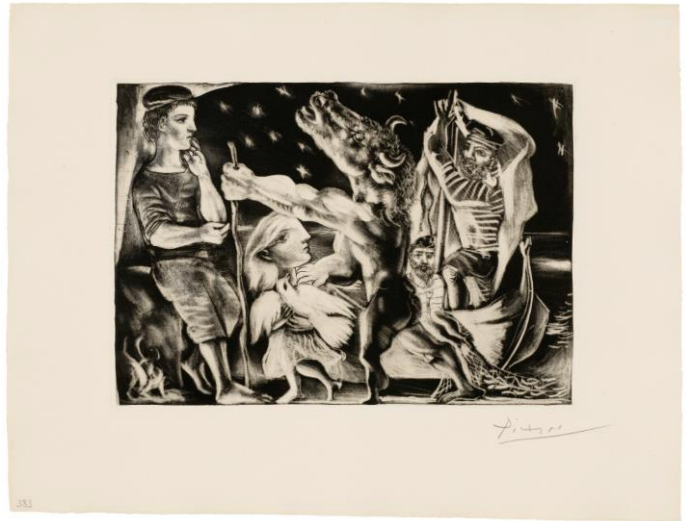
Andy Warhol, Grapes (1979, estimate: £180,000-250,000) and Pablo Picasso, Minotaure aveugle guidé par une fillette dans la nuit (1939, estimate: £80,000-120,000)