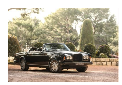
1990 BENTLEY CONTINENTAL TWO DOOR CONVERTIBLE

COACHWORK BY MULLINER PARK WARD VIN SCBZD02D9LCX30295 Price Realized: $441,000