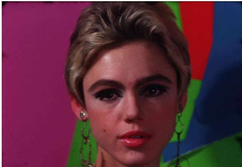
Andy Warhol, Edie Sedgwick [ST312] , 1965

16mm film, color, silent, 4.4 minutes at 16 frames per second