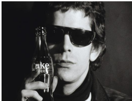
Andy Warhol, Lou Reed (Coke) [ST269], 1966 16mm film, black-and-white, silent, 4.5 minutes at 16 frames per second