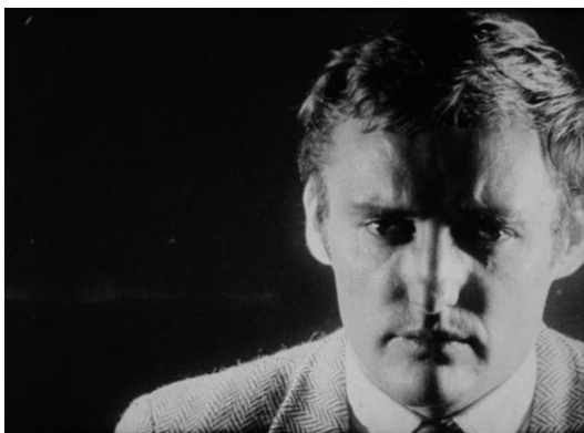
Andy Warhol, Dennis Hopper [ST155], 1964 16mm film, black-and-white, silent, 4.3 minutes at 16 frames per second