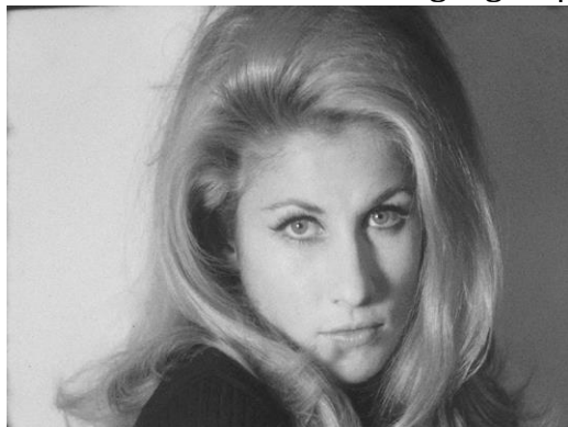
Andy Warhol, Jane Holzer [ST144], 1964 16mm film, black-and-white, silent, 4 minutes at 16 frames per second