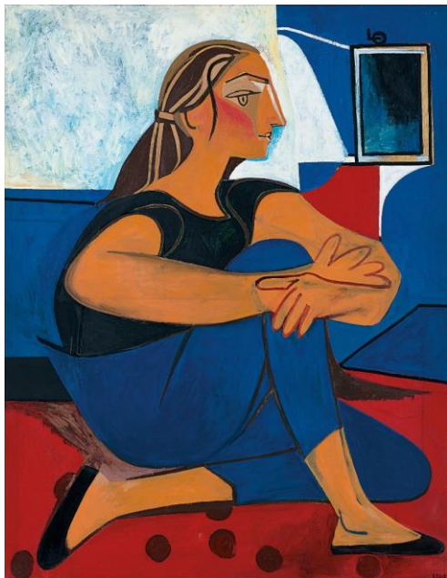
Étude bleue oil on panel 147 x 115.2 cm. (57 7/8 x 45 3/8 in.) Painted in 1953

26 November – 1 December | Hong Kong Convention and Exhibition Centre