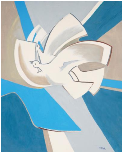
White cloud oil and charcoal on canvas 100 x 81.5 cm. (39.3/8 x 32 in.) Painted in 2014