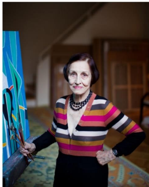
Françoise Gilot in her Manhattan atelier, 2011.

Hong Kong – Christie's and HomeArt proudly present 【Françoise Gilot: A Celebration】 - an exhibition showcasing some of the most important works from throughout Gilot's career, to celebrate the extraordinary life of the artist on her 100 th birthday.