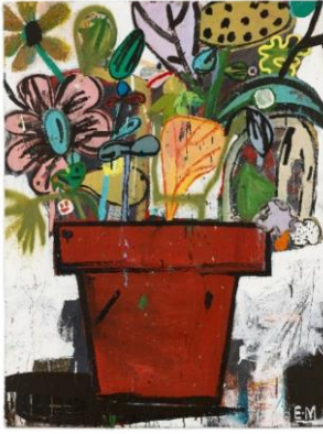
EDDIE MARTINEZ (B. 1977) Big Pink

oil, acrylic and spray paint on wood 122 x 91.5 cm. (48 x 36 in.) Painted in 2009