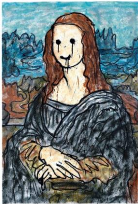
MADSAKI (B. 1974) Mona Lisa

acrylic and aerosol on canvas 105.5 x 72 cm. (41 1/2 x 28 3/8 in.) Painted in 2018