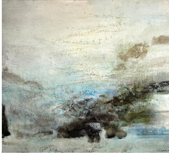
ZAO WOU-KI (ZHAO WUJI, 1920-2013) 31.10.75-06.09.79

Open for Bidding: 12 – 22 March Preview: 15 – 22 March