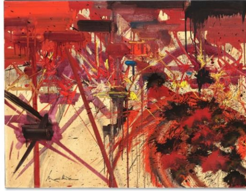
GEORGES MATHIEU (1921-2012) L'adversité généreuse

acrylic on canvas 89 x 115.5 cm. (35 x 45 1/2 in.) Painted in 1989