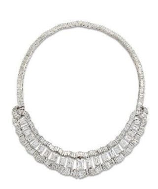
From The Collection of Lord & Lady Weinstock, Diamond Necklace circa 1965, Estimate: £70,000–90,000

Further Jewellery highlights this season include a selection of jewels from <u>The Collection of Lord & Lady Weinstock</u>, which will be sold at Christie's London on 22 November (please find the dedicated feature <u>here</u>). Crowning the selection of Lady Weinstock's jewellery is a superb diamond necklace, circa 1965, (estimate: £70,000–90,000), alongside a fine 19<sup>th</sup> century diamond tiara (estimate £60,000–80,000), purchased from renowned dealer S.J. Phillips. These are offered alongside a wide range of jewels including a number of highly desirable pieces by Van Cleef & Arpels, with viewing at Christie's King Street from the 17 to 22 November.