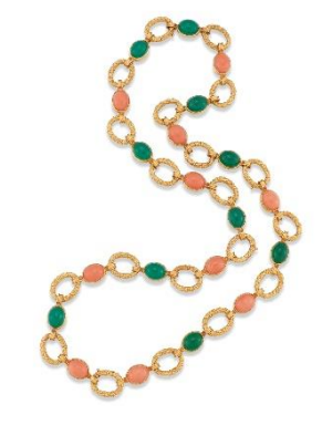
From The Collection of Lord & Lady Weinstock, Van Cleef & Arpels Coral and Chrysoprase Necklace, 1970s, Estimate: £25,000–35,000