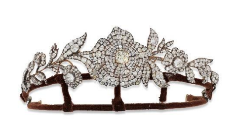
From The Collection of Lord & Lady Weinstock, A Fine 19<sup>th</sup> Century Diamond Tiara, 1830s-40s, Estimate: £60,000–80,000