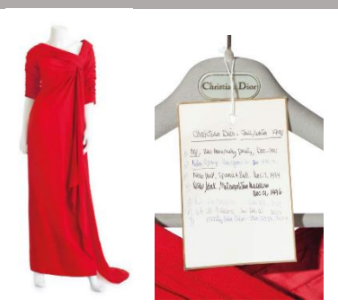
A CHRISTIAN DIOR COUTURE RED CREPE GOWN $2,000-4,000 Included in the Online sale