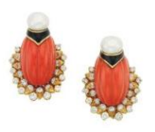
A PAIR OF CORAL, CULTURED PEARL AND DIAMOND EAR CLIPS, BY DAVID WEBB $3,000-5,000