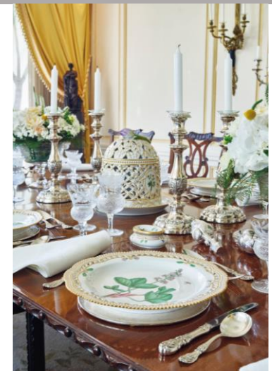
The dining room at Mrs. Bloomingdale's Hollywood Regency villa, Los Angeles.