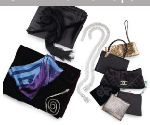
EVENING STYLE CAPSULE $1,500-2,500