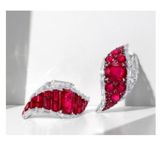
BOGHOSSIAN BURMESE NO HEAT TRAETMENT RUBY AND DIAMOND EARRINGS