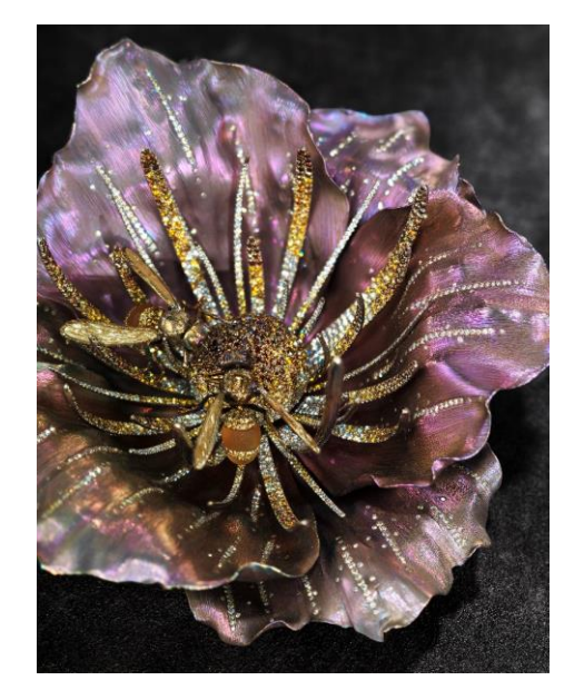
WALLACE CHAN 'CELESTIAL BEAUTY' COLOURED DIAMOND AND DIAMOND BROOCH