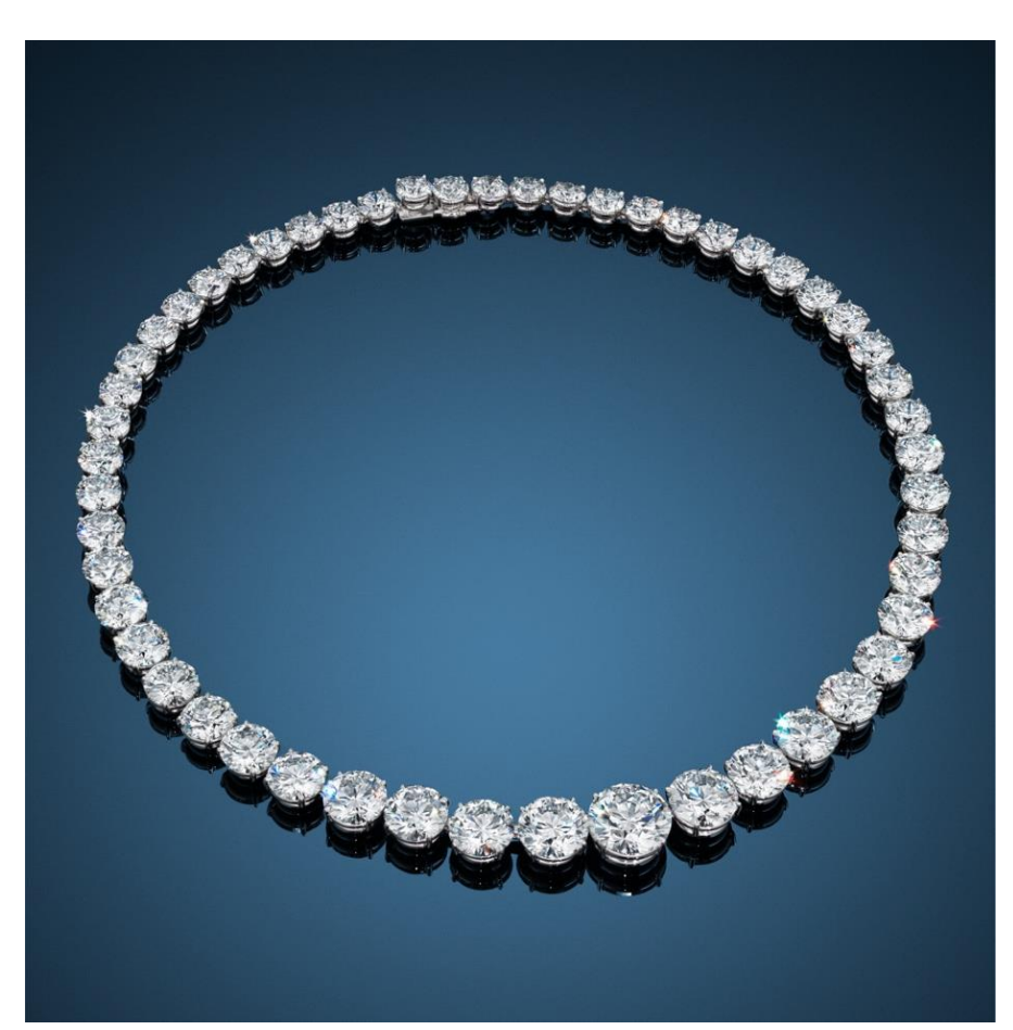
AN EXQUISITE DIAMOND RIVIÈRE (DIAMOND: 7.14 TO 1.07 CARATS, D COLOUR, FLAWLESS TO INTERNALLY FLAWLESS CLARITY, A FEW TYPE IIA, 104.84 CARATS TOTAL)

Christie's Hong Kong is delighted to continue our heritage of offering the best diamonds at auction, with the Exquisite Diamond Rivière Necklace of 104.84 Carats. A necklace with 52 D colour, FLAWLESS to INTERNALLY FLAWLESS clarity diamonds with excellent cut, polish, and symmetry is extremely rare, and to be composed of diamonds of such quality ranging from 7.14 to 1.07 carats is simply extraordinary. This is definitely one of the finest and most exquisite rivière necklaces one can expect to find in the market.