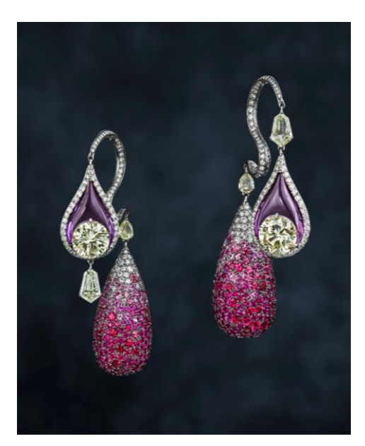
WALLACE CHAN MULTI-GEM EARRINGS