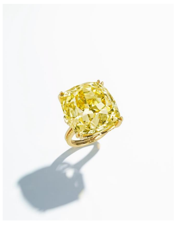
A 60.79 CARATS FANCY VIVID YELLOW VS2 CLARITY DIAMOND RING