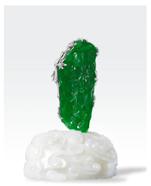
A MAGNIFICENT JADEITE "GUANYIN" CARVING