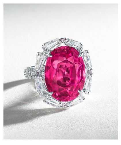
A 19.61 CARATS BURMESE PINK SAPPHIRE AND DIAMOND RING