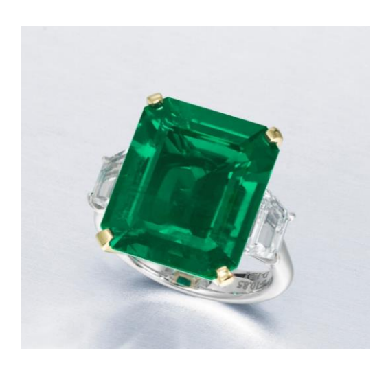
A 10.85 CARATS COLOMBIAN EMERALD AND DIAMOND RING