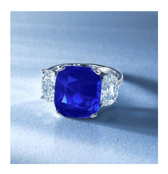
AN 8.50 CARATS KASHMIR SAPPHIRE AND DIAMOND RING