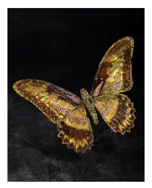
WALLACECHAN 'HOPE' MULTI-GEM BROOCH

On offer at Christie's Hong Kong this autumn is a selection of three magnificent masterpieces created through Wallace Chan's poetic imagination and meticulous craftsmanship. These mesmerising pieces are a perfect representation of his mastery of the complexity of titanium, further enhanced with gems and diamonds that shine with a majestic, magical sparkle and glow.