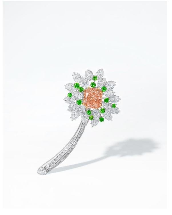
A 5.02 CARATS FANCY INTENSE ORANGY PINK "GOLCONDA" DIAMOND, DIAMOND AND GARNET BROOCH