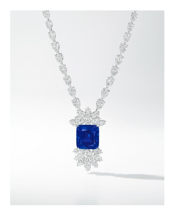
RONALD ABRAM 52.88 CARATS BURMESE SAPPHIRE AND DIAMOND NECKLACE