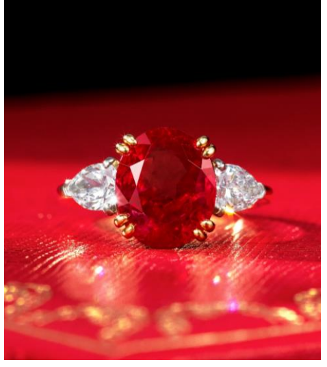
CARTIER 5.32 CARATS BURMESE "PIGEON'S BLOOD" RUBY AND DIAMOND RING