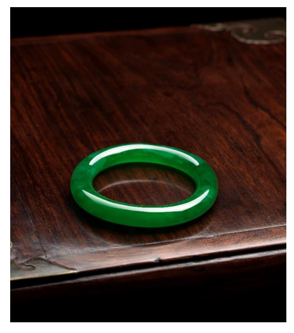
AN EXCEPTIONAL JADEITE BANGLE

This season's captivating and exquisite jadeite pieces are led by An Exceptional Jadeite Bangle (HK$25 million - 35 million), featuring an exceptionally vivid green colour and superb translucency. Another highlight among the offerings is A Magnificent Jadeite " Guanyin " Carving (HK$9 million - 13 million) in glowing vivid green and with excellent translucency. Belonging to a private collector, the piece was meticulously carved out of thick jadeite and is of an impressive size. Pictured below on a white nephrite stand, the piece can also be worn as a pendant. Rounding off the jadeite selection is a group of exclusive jadeites from a private collector who has been collecting the finest jadeite for over 30 years. The top lot of the group is a pair of tri-colour jadeite bangles (HK$2.8 million - 3.8 million), bound to be highly coveted by jadeite enthusiasts.