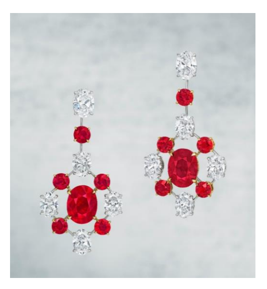
A PAIR OF 4.10/4.05 CARATS BURMESE "PIGEON'S BLOOD" RUBY AND DIAMOND EARRINGS

Burmese "Pigeon's Blood" Rubies, Kashmir sapphires, and Colombian emeralds, particularly those without any heat or artificial treatment, remain the most sought after, valuable, alluring, and rare gemstones in the world. As the mines producing these top-quality gemstones are becoming increasingly exhausted, whenever these dazzling treasures appear at auction, they generate fierce competition and often fetch exceptionally high prices in Christie's global salerooms.