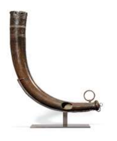
An Irish bronze side-blow horn late bronze age, circa 8th-7th century b.c. (Estimate £30,000-50,000)