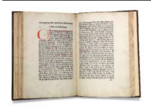
The Caxton Cicero Marcus Tullius Cicero (106-43 BCE). Of Old Age; Of Friendship; Of Nobility by Bonaccursius de Montemagno. [Westminster:] William Caxton, 12 August 1481; August 1481. [Bound with:] Geoffrey de la Tour Landy. The Knight of the Tower, translated by William Caxton. Westminster: [William Caxton], 31 January 1484. A fragment of 7 leaves. (Estimate £250,000-350,000)

Highlights from the medieval and Renaissance manuscripts include a series of high-quality Books of Hours painted in 15th-century France and the Low Countries, one painted in 1420s Paris by a follower of the Master of the Gingins Last Judgment, another a lively example of Hainaut illumination from the 1460s. Elsewhere, the sale is strong in music, including a single-owner collection of autograph musical quotations and composers' letters; science, including a first edition of Darwin's Origin of Species and Einstein letters; and book illustration, including a rare edition of A Happy Pair , Beatrix Potter's first published work, plus original illustrations by Quentin Blake.