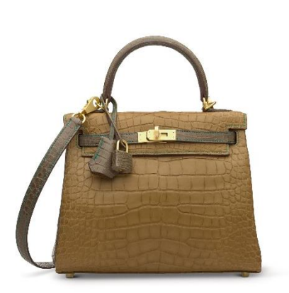
A CUSTOM MATTE KRAFT & ORIGAN ALLIGATOR RETOURNÉ KELLY 25 WITH BRUSHED GOLD HARDWARE HERMÈS, 2021

Estimate: HK$600,000 - HK$800,000 / US$77,000 - 100,000