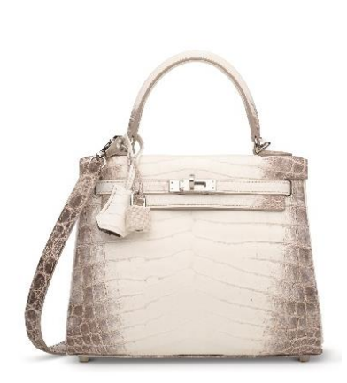
A RARE, MATTE WHITE HIMALAYA NILOTICUS CROCODILE RETOURNÉ KELLY 25 WITH PALLADIUM HARDWARE HERMÈS, 2020

Estimate: HK$1,000,000 - 1,800,000 / US$130,000 - 230,000