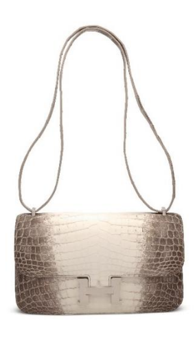
A RARE, CUSTOM MATTE WHITE HIMALAYA NILOTICUS CROCODILE CONSTANCE ÉLAN WITH PALLADIUMHARDWARE

Estimate: HK$1,000,000 - 1,800,000 / US$130,000 - 230,000