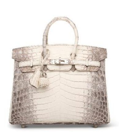
A RARE, MATTE WHITE HIMALAYA NILOTICUS CROCODILE BIRKIN 25 WITH PALLADIUM HARDWARE HERMÈS, 2020

Estimate: HK$1,000,000 - 1,800,000 / US$130,000 - 230,000