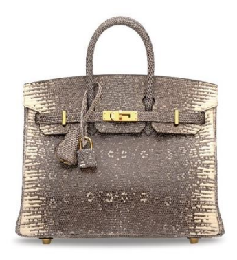
A SHINY OMBRÉ SALVATOR LIZARD BIRKIN 25 WITH GOLD HARDWARE HERMÈS, 2021

Estimate: HK$400,000 - 500,000 / US$52,000 - 64,000