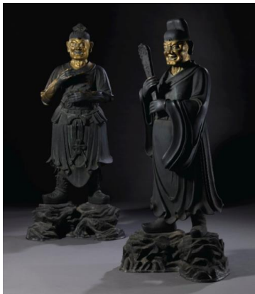
TWO MASSIVE PARCEL-GILT BRONZE FIGURES OF DEITIES LATE MING DYNASTY, 16TH-17TH CENTURY PRICE REALIZED: $1,158,000