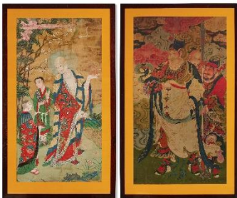
TWO LARGE SILK PAINTINGS OF IMMORTALS WITH ATTENDANTS CHINA, LATEMING-QING DYNASTY, 17TH-18TH CENTURY PRICE REALIZED: $75,000