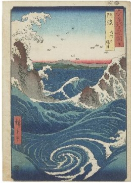
UTAGAWA HIROSHIGE (1797-1858) Awa, naruto no fuha (wind and waves at naruto, awa province) PRICE REALIZED: $23,750