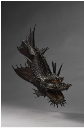
AN IRON ARTICULATED SCULPTURE OF A MYTHICAL BEAST (SHACHI) EDO PERIOD (18TH CENTURY), SIGNED TOTO JU MYOCHIN SHIKIBU (SOSUKE) PRICE REALIZED: $625,000