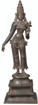
A LARGE BRONZE FIGURE OF SHRI DEVI SOUTH INDIA, TAMIL NADU, VIJAYANAGARA PERIOD, 15TH CENTURY PRICE REALIZED: $387,500