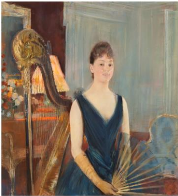
PAUL-CÉSAR HELLEU (French, 1859-1927)

Harpiste assise à l'éventail pastel on canvas $120,000-180,000