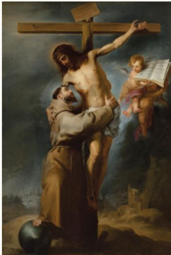
BARTOLOMÉ ESTEBAN MURILLO (SEVILLE 1618-1682) Saint Francis embracing Christ on the cross oil on canvas $1,200,000-1,800,000

We are delighted to offer an Egyptian red glass royal male head formerly in The Resandro Collection; a unique Roman pavonazetto and giallo antico herm that had once formed part of the collection of the Baron Rochdale, Lingholm, Cumbria; and a selection of recently-rediscovered vases collected by Cornelius Vanderbilt II in the 1890s and previously displayed at The Breakers in Newport, Rhode Island. Other lots will include a Mycenaean pottery amphoroid krater with octopuses; a large Roman marble mosaic adorned with desert animals in a landscape; and a group of Sumerian clay Cuneiform tablets from The Collection of William Tyssen-Amherst, 1 st Baron Amherst of Hackney.