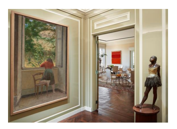
Entry Foyer with Balthus, Jeune fille à la fenêtre and Degas, Petite danseuse de quatorze ans