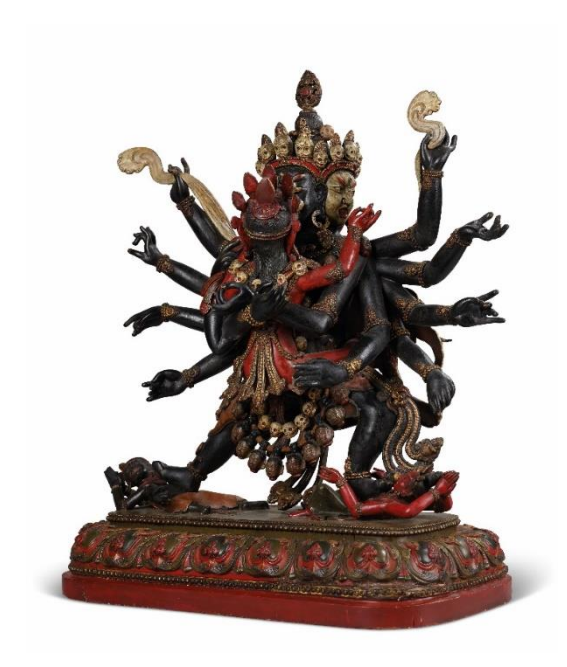
A Magnificent Imperial Polychrome Sandalwood Figure of Chakrasamvara and Vajravarahi

Kangxi Period (1662-1722) 23.5/8 in. (60 cm.) high Estimate: HK$3,800,000 – 5,500,000 / U$$490,000 – 700,000