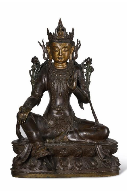
A Large Bronze Figure of Avalokiteshvara Ming Dynasty, 15<sup>th</sup> Century

Kangxi Period (1662-1722) 23.5/8 in. (60 cm.) high Estimate: HK$3,800,000 – 5,500,000 / U$$490,000 – 700,000