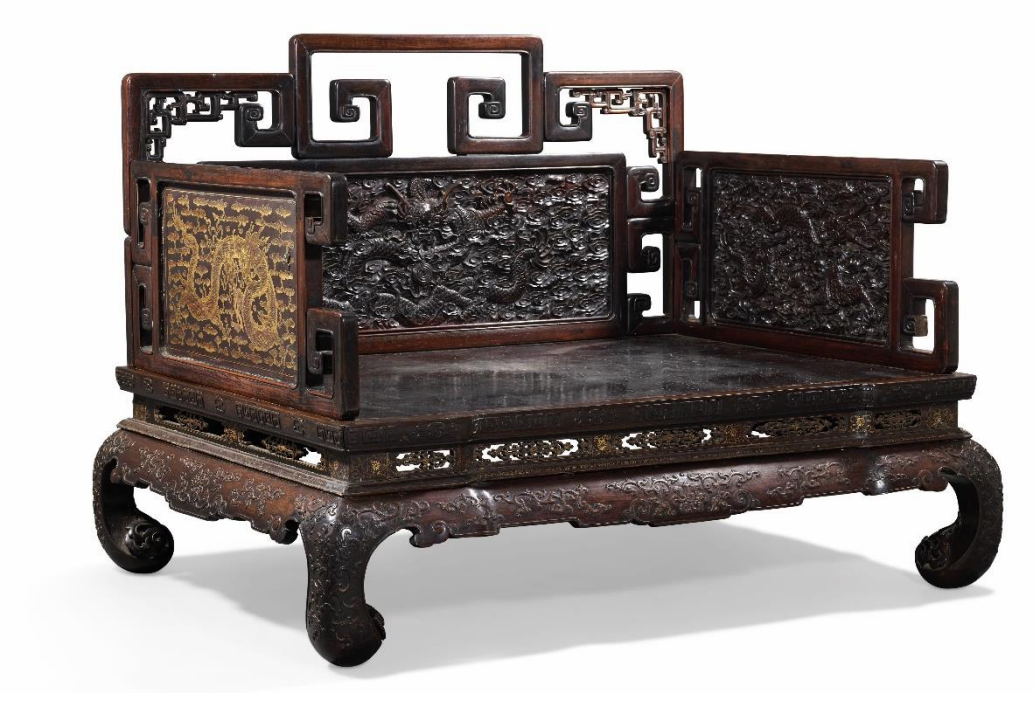
THE PROPERTY OF A LADY

A Rare Imperial Zitan and Hardwood Gilt-Lacquered Throne Qing Dynasty (18<sup>th</sup> – 19<sup>th</sup> Century) 37.3/4 in. (96 cm.) high, 50 in. (127 cm.) wide, 39.1/2 in. (100.3 cm.) deep Estimate: HK$5,000,000 – 7,000,000 / US$650,000 – 900,000