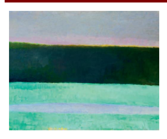
Property From A New York Private Collection WOLF KAHN (B. 1927) Landscape Bands oil on canvas Painted in 1990. Estimate: $20,000-30,000