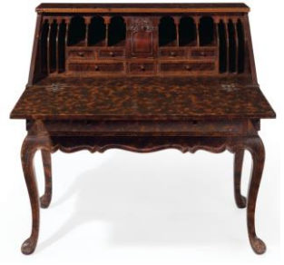
PRESIDENT RONALD REAGAN 'THE GOVERNOR'S DESK' AN AMERICAN SCUMBLE-PAINTED SLANT FRONT DESK BY DON GUSTAFSON, 1971 Estimate: $4,000-6,000