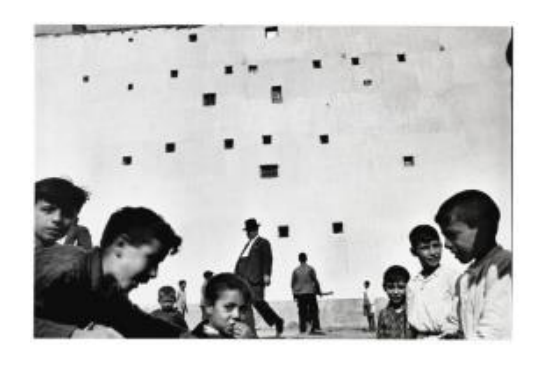
FROM PICTORIALISM INTO MODERNISM: 80 YEARS OF PHOTOGRAPHY April 30 – May 13