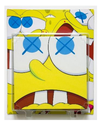
VICE May 12-27