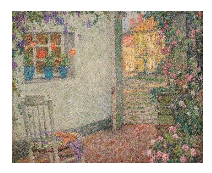
LA VIE EN ROSE May 12-28