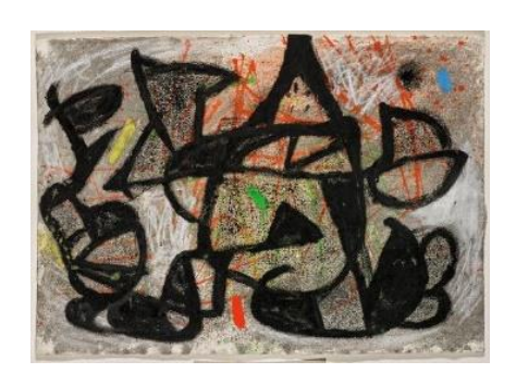
FORM AND FANTASY May 29 – June 11