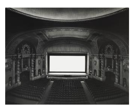
PHOTOGRAPHS May 19 – June 3