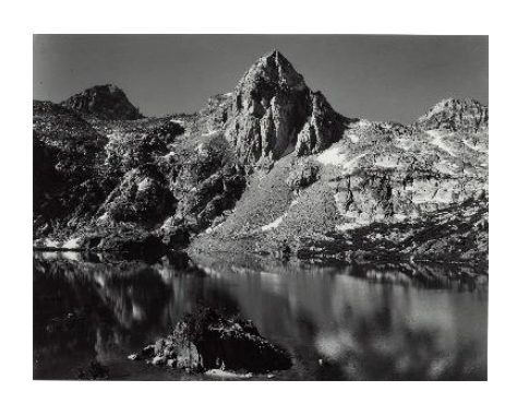
ANSEL ADAMS AND THE AMERICAN WEST PHOTOGRAPHS FROM THE CENTER FOR CREATIVE PHOTOGRAPHY