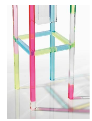
MAKING SPACE: DESIGN ONLINE May 19 – June 2