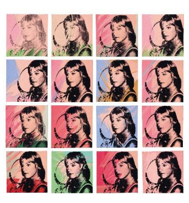
VIRTUE May 29 – June 12