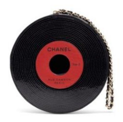
CHANEL, SPRING/SUMMER 2004 A LIMITED-EDITION BLACK & RED PATENT LEATHER RECORD CLUTCH WITH GOLD HARDWARE $3,000 - 4,000