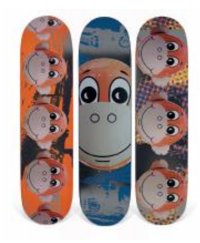
SUPREME, 2006 A SET OF THREE JEFF KOONS MONKEY TRAIN SKATEBOARDS $3,000 - 5,000