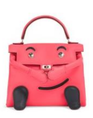
HERMÈS, 2018 A ROSE AZALEA SWIFT LEATHER QUELLE IDOLE WITH PALLADIUM HARDWARE $10,000 – 15,000