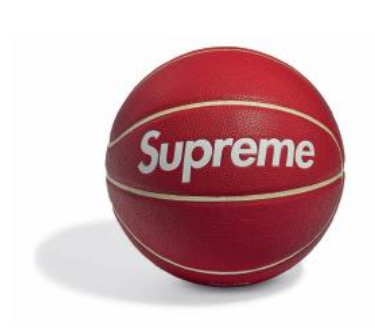
SUPREME A SPALDING BASKETBALL $10,000 - 15,000