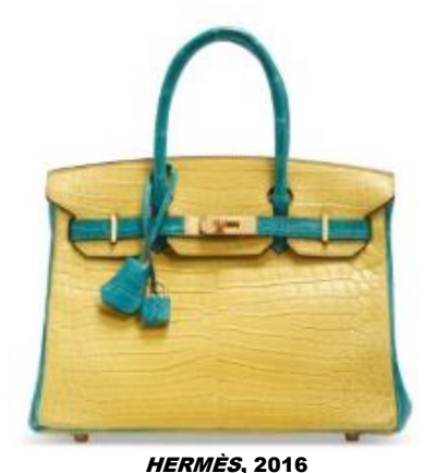
PAON POROSUS CROCODILE BIRKIN 30 WITH BRUSHED GOLD HARDWARE $30,000 - 50,000