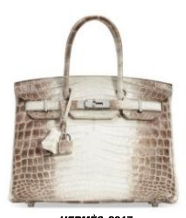
HERMÈS, 2017 A RARE, MATTE WHITE HIMALAYA NILOTICUS CROCODILE BIRKIN 30 WITH PALLADIUM HARDWARE $40,000 - 60,000