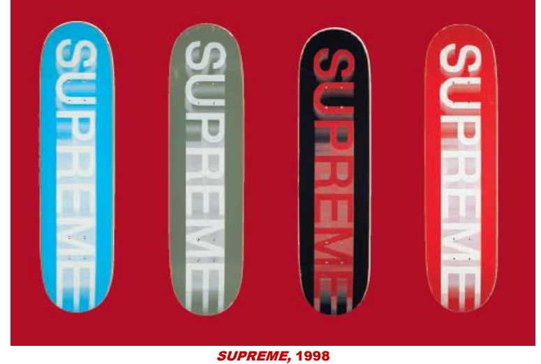
A SET OF FOUR MOTION LOGO SKATEBOARDS $3,000 - 5,000