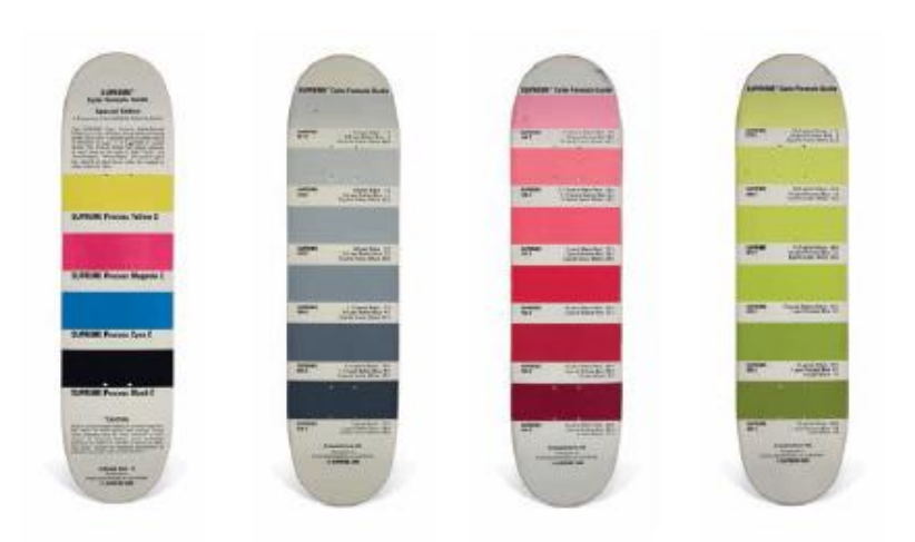
SUPREME, 2001 A SET OF FIVE RYAN MCGUINESS PANTONE SKATEBOARDS $10,000 – 15,000