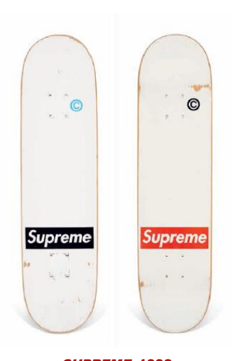
SUPREME, 1998 A SET OF TWO COPYRIGHT SKATEBOARDS $2,000 – 3,000