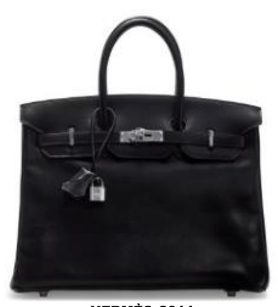
HERMÈS, 2011 A LIMITED EDITION BLACK CALFBOX LEATHER SO BLACK BIRKIN 35 WITH BLACK PVC HARDWARE $12,000 - 15,000