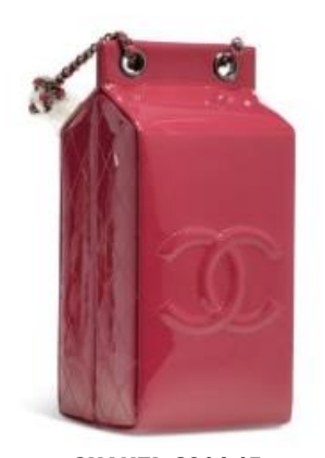
CHANEL, 2014-15 A DARK PINK PATENT LEATHER MILK CARTON BAG $2,000 – 3,000