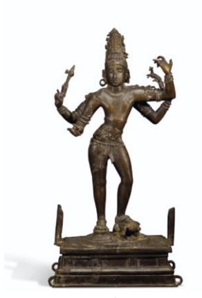
A RARE AND MAGNIFICENT BRONZEFIGURE OF SHIVATRIPURAVIJAYA SOUTH INDIA, TAMIL NADU, CHOLA PERIOD, CIRCA 1050 PRICE REALIZED: $4,350,000 RECORD FOR ASOUTH INDIAN SCULPTURE

GLOBAL PARTICIPATION WITH BIDDERS FROM 41 COUNTRIES AND 5 CONTINENTS 13 LOTS ACHIEVED OVER $1M AND 13 RECORDS SET STRONGEST SEASON FOR INDIAN AND SOUTHEAST ASIAN ART IN OVER A DECADE