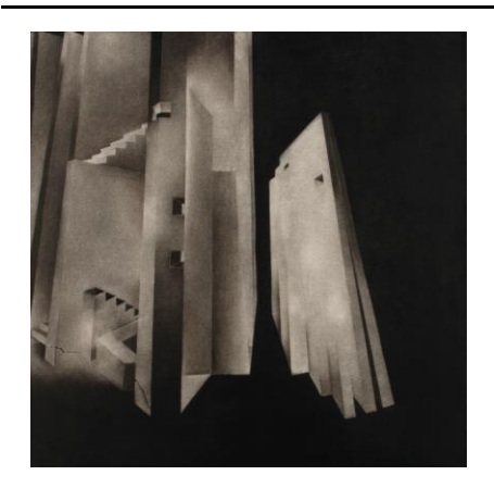
RAMESHWAR BROOTA (B. 1941) SILENT STRUCTURES OIL ON CANVAS. 47 X 47 IN. PRICE REALIZED: $525,000

Christie's sale of Japanese Art and Korean Art totaled $8,475,000 with 82% sold by lot and 84% sold by value. The top lot of the sale was a woodblock print by Katsushika Hokusai (1760-1849), "The Great Wave," which achieved $1,110,000 against a low estimate of $150,000 and set the record for the print by the artist. Other notable results included an important pair of six-panel screens by Kano Tsunenobu (1636-1713), Chrysanthemums Blooming in a Garden that sold for $175,000; along with prints by Utagaw a Hiroshige (1797-1858), Kitagaw a Utamaro (1753-1806), and Katsushika Hokusai (1760-1849), including "Red Fuji" that sold for $337,500. Additionally, modern and contemporary works performed with strong results including Morita Shiryu (1912-1998), Choo (Conspicuousness), that realized $137,500; and Kato Gizan (B. 1968), Jigen (Manifestation) that sold for $312,500. Featured Korean works included a blue and white porcelain jar with three worthies playing weiqi, Joseon dynasty that sold for $750,000; and an impressive eight-panel screen from the circle of Kim Hongdo (1745-1806), titled Hunting Scene that achieved $930,000 against a low estimate of $100,000. Browsesale results here.