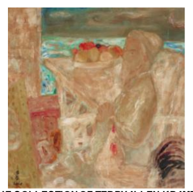
THE COLLECTION OF TERRY ALLEN KRAMER LE PHO (1907–2001) LE PHILOSOPHE (PHILOSOPHER) PRICE REALIZED: $100,000

The James and Marilynn Alsdorf Collection Online totaled $639,500 with 90% sold by lot, 100% sold by value, and 262% hammer above low estimate. The top lot of the sale was a silver-damascened iron helmet, Tibet or Mongolia, 17th-18th century, that sold for $62,500 against its low estimate of $6,000. Other notable results were achieved for porcelains from the Kangxi period, jade carvings, Himalayan bronze figures, a Chinese painting signed Lin Liang, and a Japanese painting attributed to Nagasawa Rosetsu. Browsesale results here.