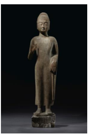
A MAGNIFICENT LARGE GREYLIMESTONE STANDING FIGURE OF BUDDHA NORTHERN QIDYNASTY (AD 550-577) PRICE REALIZED: $2,550,000

New York – Christie's Asian Art Week New York achieved a total of $82,830,875 with 90% by value, 84% sold by lot, and 175% hammer above low estimate across the eight live auctions. There was global participation with bidders from 41 countries across five continents. Additionally, unique visitors from over 110 countries visited the sale pages leading into the week. During the week 13 records were achieved and 13 lots exceeded $1m across all geographies of Asian art. Online sales continue through October 1.