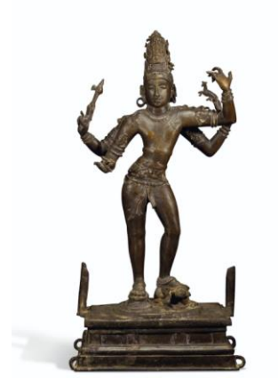
A RARE AND MAGNIFICENT BRONZEFIGURE OF SHIVATRIPUR AVIJAYA. SOUTH INDIA, TAMIL NADU, CHOLA PERIOD, CIRCA 1050. PRICE REALIZED: $4,350,000 RECORD FOR ASOUTH INDIAN SCULPTURE

One of the most important collections of Gandharan art in private hands, Devotion in Stone: Gandharan Masterpieces from a Private Japanese Collection achieved a total of $13,878,750, more than quadrupling its pre-sale low estimate. The top lot of the sale was a rare and magnificent gray schist triad of Buddha Shakyamuni with bodhisattvas that sold for $6,630,000 against a low estimate of $600,000 and achieved a world auction record for a Gandharan work of art. One of a very few dated Gandharan works of art known and published in more than thirty publications, the triad is perhaps the most important Gandharan sculpture to come to market. The sale also featured a superbly-carved large and important gray schist figure of a bodhisattva that more than doubled its low estimate realizing $3,630,000; a monumental gray schist figure of Buddha Shakyamuni that more than doubled its low estimate selling for $810,000. Browsesale results here.