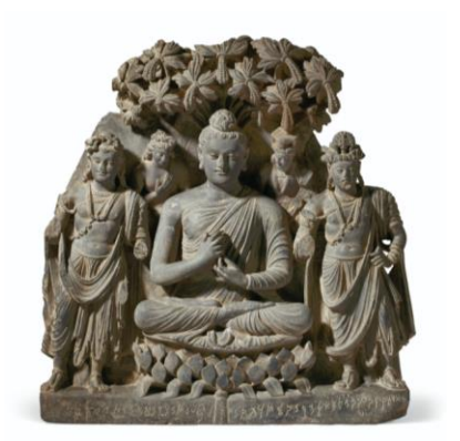
A RARE AND MAGNIFICENT GRAY SCHIST RELIEF TRIAD OF BUDDHA SHAKYAMUNI WITH BODHISATTVAS ANCIENT REGION OF GANDHARA, DATED BY INSCRIPTION TO YEAR 5, 3RD-4TH CENTURY CE PRICE REALIZED: $6,630,000 RECORD FOR AGANDHARAN WORK OF ART

The sale of <u>South Asian Modern + Contemporary Art</u> totaled $4,904,750. The top lot of the sale was an important painting by Tyeb Mehta, Untitled from 1974 that sold for $1,110,000. Other notable results included Jehangir Sabavala's widely published pastoral painting, The Peasants which appeared for the first time at auction and achieved $966,000 establishing the world auction record for the artist. Other highlights included exceptional examples works by of modern masters such as The Pull , a rare early work by Maqbool Fida Husain that sold for $822,000; and Candameric , a sublime landscape from 1969 by Sayed Haider Raza that achieved $175,000. Additionally, strong prices were realized for contemporary works by the region's most renowned practitioners like Nalini Malani and Imran Qureshi. Additionally, B. Vithal's Untitled (Horses) sold for $27,500 setting a new auction record for the artist. The sale also included the complete 1991 portfolio, House with Four Walls , by Zarina, that sold for $62,500. Browsesale results here.