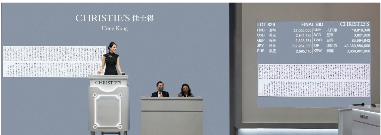
Lot 829 Wen Zhengming's "Fu Di" Poems in Running Cursive Script, the top lot of the sale series, under the hammer with auctioneer Liang-Lin Chen