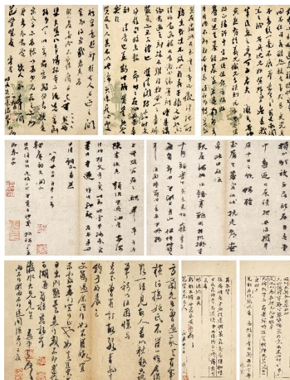
Lot 882 DING JING (1695-1765) AND OTHERS Correspondences

Price Realised: HK$26,850,000 / US$3,467,900 More than 17 times over its pre-sale high estimate of HK$1,500,000 TOP LOT OF THE SALE SERIES