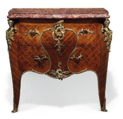
Lot 162 A PAIR OF FRENCH ORMOLU-MOUNTED KINGWOOD, MAHOGANY AND BOIS DE BOUT MARQUETRY COMMODES BY FRANÇOIS LINKE, MOUNTS DESIGNED BY LEON MESSAGE, CIRCA 1900 Estimate: $40,000-60,000