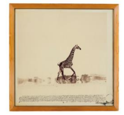
LOT1069 PETER BEARD (B. 1938) Running Giraffe , 1960 Estimate: $30,000-50,000

LOT1017 A SET OF FIFTEEN INDIAN REVERSE-PAINTED GLASS PICTURES LATE 19TH/20TH CENTURY, WITHIN FRAMES DESIGNED BY RENZO MONGIARDINO Estimate: $10,000-15,000