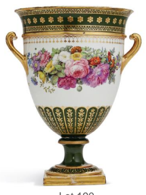
Lot 190 A SEVRES (HARD PASTE) PORCELAIN GREEN-GROUND ICE-PAIL FROM THE 'SERVICE A FLEURS DE L'IMPERATRICE JOSEPHINE' CIRCA 1809, Estimate: $25,000-40,000