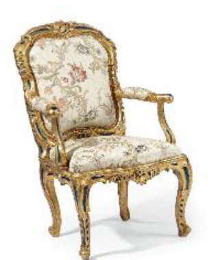
Lot 242 A PAIR OF NORTH ITALIAN GILTWOOD AND BLUE GLASS ARMCHAIRS VENICE, CIRCA 1740 Estimate: $40,000-60,000