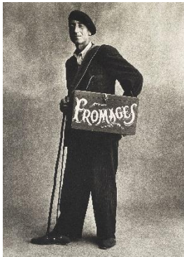
IRVING PENN (1917–2009)