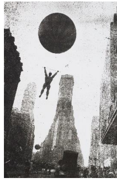
ROBERT FRANK (1924–2019)