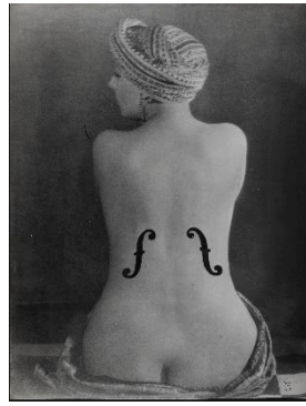
MAN RAY (1890–1976)