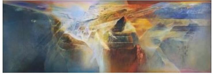
PRATUANG EMJAROEN Grand Canyon Price Realised: HK$4,250,000/ US$547,657