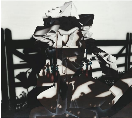
AVERY SINGER Untitled (Tuesday) Price Realised: HK$35,050,000/ US$4,516,561