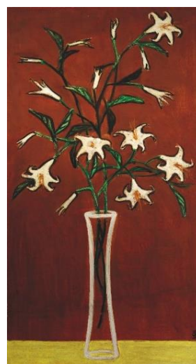
SANYU Vase de lys sur fond marron (Vase of Lilies with Red Ground)

Price Realised: HK$140,400,000/ US$18,092,014