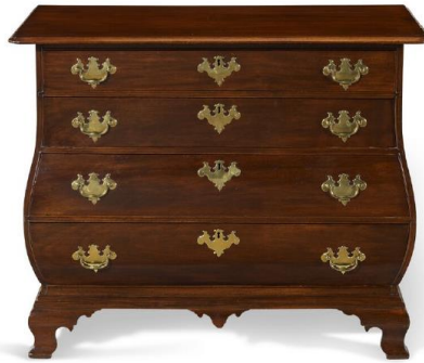
CHIPPENDALE MAHOGANY BOMBE CHEST- OF-DRAWERS MARBLEHEAD, MASSACHUSETTS, CIRCA 1770 33½ in. high, 41 in. wide, 21½ in. deep $100,000-300,000