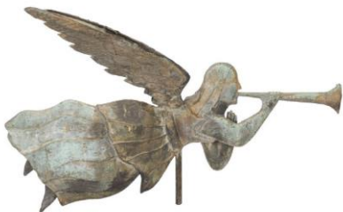
A MOLDED COPPER FLYING ANGEL GABRIEL WEATHERVANE ATTRIBUTED TO J. W. FISKE, NEW YORK, LATE 19TH CENTURY 17 in. high, 26½ in. wide, 8¼ in. deep $60,000-90,000