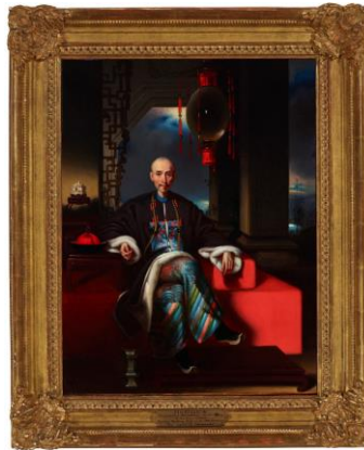
SCHOOL OF LAMQUA (MID-19TH CENTURY) Portrait of Houqua oil on canvas 25 x 19¼ in. (63.5 x 49 cm.) $60,000-80,000