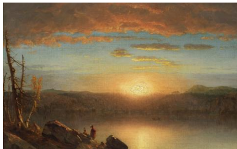
SANFORD ROBINSON GIFFORD (1823-1880) Indians at Sunset (Sunset in the Wilderness) oil on canvas 8 3/4 x 15 in. (22.2 x 38.1 cm.) Painted circa 1859. $120,000-180,000