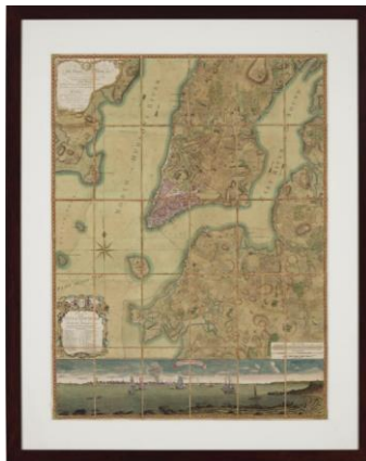
PLAN OF THE CITY OF NEW YORK, IN NORTH AMERICA SURVEYED IN THE YEARS 1766 & 1767 BERNARD RATZER $300,000-500,000