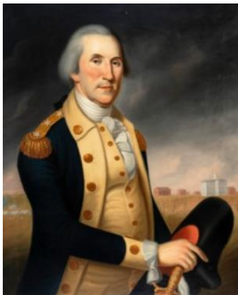
CHARLES PEALE POLK (1767-1822) George Washington at Princeton oil on canvas $350,000-450,000