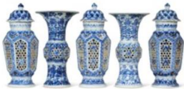
A CHINESE EXPORT BLUE AND WHITE PORCELAIN RETICULATED DOUBLE- WALLED FIVE-PIECE GARNITURE KANGXI PERIOD (1662-1722) 10¾ in. (27.3 cm.) high, the jars and covers $20,000-30,000