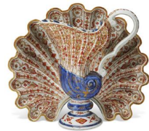
A CHINESE IMARI PORCELAIN EWER AND BASIN FIRST QUARTER 18TH CENTURY $15,000-20,000