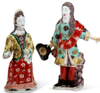
TWO CHINESE EXPORT PORCELAIN FAMILLE VERTE EUROPEAN COURT FIGURES KANGXI PERIOD, CIRCA 1715-1720 9¾ in. (24.4 cm.) high, the 'Dauphin' $20,000- 30,000