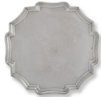
AN AMERICAN SILVER SALVER MARK OF JACOB HURD, BOSTON, MASSACHUSETTS, CIRCA 1735 $25,000-40,000