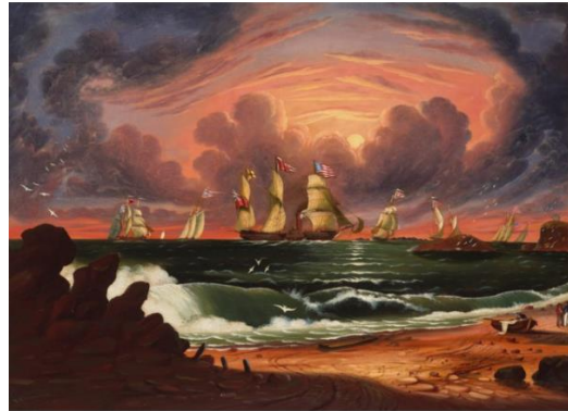
THOMAS G. CHAMBERS (1808-1869) View Of Nahant [Sunset] oil on canvas 25 1/4 x 35 in. $60,000-80,000