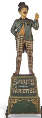
A CARVED AND POLYCHROME PAINT- DECORATED CIGAR STORE FIGURE OF A 'RACETRACK TOUT' POSSIBLY NEW YORK, LATE 19TH CENTURY 86 in. high $300,000-500,000