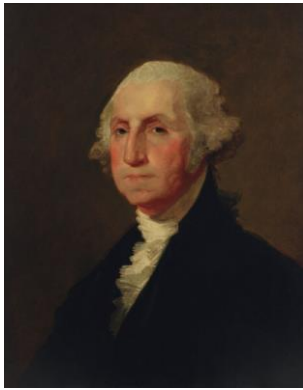
GILBERT STUART (1755-1828) GEORGE WASHINGTON oil on panel 27 x 21½ in. Painted circa 1820 $200,000-300,000