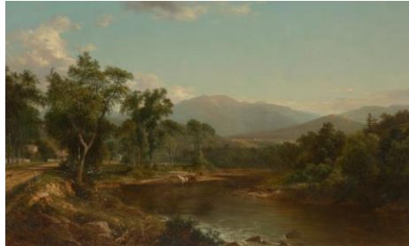
DAVID JOHNSON (1827-1908) Mount Lafayette from Franconia, New Hampshire oil on canvas 30 x 50 in. (76.2 x 127 cm.) Painted in 1874-75. $100,000-150,000