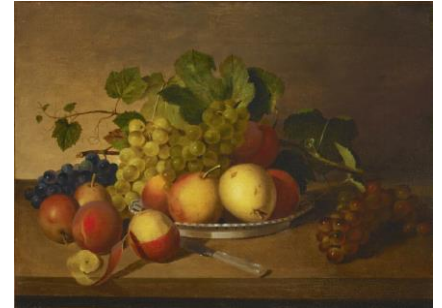
Property from the Collection of Florida International University JAMES PEALE (1749-1831) Still Life oil on canvas 16 x 22 in. (40.6 x 55.9 cm.) Painted in 1827. $120,000-180,000