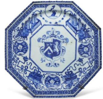
A LARGE CHINESE EXPORT PORCELAIN BLUE AND WHITE ENGLISH MARKET ARMORIAL CHARGER CIRCA 1705 $5,000-7,000