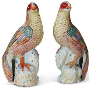
A PAIR OF CHINESE EXPORT PORCELAIN FAMILLE ROSE PHEASANTS QIANLONG PERIOD (1736-1795) $20,000-30,000