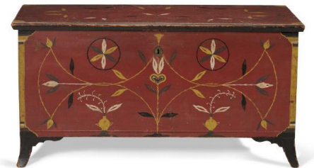
A FEDERAL RED-PAINTED AND POLYCHROME-DECORATED POPLAR BLANKET CHEST CENTRE COUNTY, POSSIBLY THE FORKS (NOW COBURN) VICINITY, PENNSYLVANIA, 1815-1825 25½ in. high, 49¾ in. wide, 20¾ in. deep $70,000-90,000