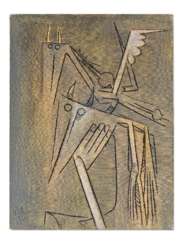
Andy Warhol, Self-Portrait (Price realised: $4,260,000), Wifredo Lam, Sans Titre (Price realised: €189,000) and Frank Stella, Double Gray Scramble (Price realised: €119,700)