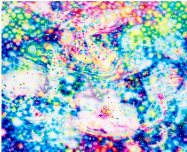
TOMOYA TSUKAMOTO (B. 1982) Brief Encounter 3 acrylic on canvas 160 x 130 cm. (63 x 51 1/8 in.) Painted in 2020

Estimate: HK$400,000 – 600,000/ US$52,000 – 77,000