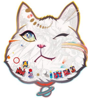
LEE KYOUNG MI (B. 1977) Nana astro-0202 signed, dated 'Kyoung Mi Lee Aug 2020' (on the reverse) oil on wood panel 80 x 70 x 3.8 cm. (31 1/2 x 27 1/2 x 1 1/2 in.) Executed in 2020

Estimate: HK$70,000 – 100,000/ US$9,000 – 12,900