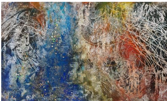
JOSÉ PARLÁ (B. 1973) Exile and the Kingdom mixed media 107 x 64 cm. (48 1/8 x 25 1/5 in.) Executed in 2019 edition AP

Estimate: HK$ 7,000 – 14,000/ US$900 – 1,800