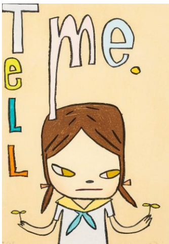
YOSHITOMO NARA (B. 1959) Tell me signed, dated '2014' and numbered '4/25' (on the lower edge) woodcut print 36 x 25.5cm. (14 1/8 x 10 in.) Executed in 2014 edition 4/25

Curated to appeal to both burgeoning and seasoned collectors alike, works are offered in all scales and sizes at accessible price points, with each lot starting at HK$1,000.