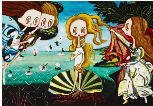
MAKI HOSOKAWA (B. 1980) The Re-birth of Venus signed and dated 'Maki 2007.12' (on the reverse) acrylic on canvas 50 x 72.5 cm. (19 5/8 x 28 1/2 in.) Executed in 2007

Estimate: HK$40,000 – 60,000/ US$5,200 – 7,800