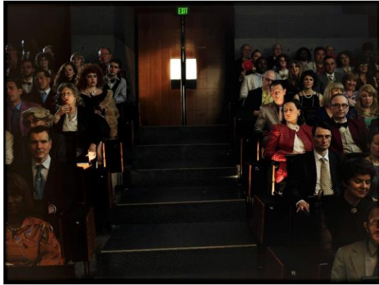
ALEX PRAGER (B. 1979) Lower level, door 2 archival pigment print 149.9 x 199.8 cm. (59 x 78 5/8 in.) Executed in 2016 edition 1/6

Estimate: HK$70,000 – 100,000/ US$9,000 – 12,900