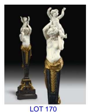
Property from an Important New England Collection

A MONUMENTAL PAIR OF AMERICAN ORMOLU-MOUNTED WHITE AND PORTOR MARBLE TORCHERES