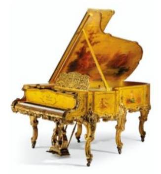
LOT 232 Property from a Private Collection, Oklahoma

A GEORGE II ASH ARMCHAIR CIRCA 1730 POSSIBLY SCOTTISH OR IRISH $8,000-12,000