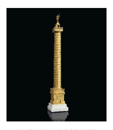
AN ITALIAN GILT-BRONZE MODEL OF TRAJAN'S COLUMN ROME, CIRCA 1820 $10,000-15,000