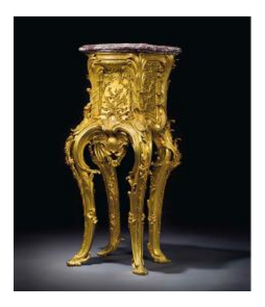
A FINE FRENCH ORMOLU PEDESTAL, LATE-19TH CENTURY AFTER A DESIGN BY JACQUES CAFFIÉRI AND CLAUDE-SIMÉON PASSEMENT; CAST BY VEUVE LELOUTRE $30,000–50,000