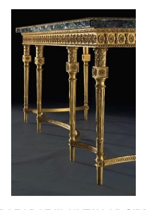
A PAIR OF GEORGE III GILTWOOD SIDE TABLES, IN THE MANNER OF ROBERT ADAM, CIRCA 1775, THE TOPS ROMAN, LATE 18TH CENTURY $80,000-120,000