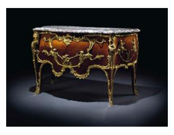
A FINE AND LARGE FRENCH ORMOLU-MOUNTED KINGWOOD AND BOIS SATINÉ THREE-PIECE BEDROOM SUITE, LATE 19TH CENTURY BY EMMANUEL ZWIENER