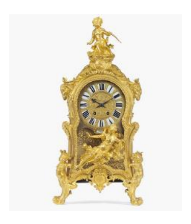
A LARGE FRENCH ORMOLU MANTEL CLOCK, LATE 19TH CENTURY BY ALFRED-EMMANUEL BEURDELEY $10,000–15,000