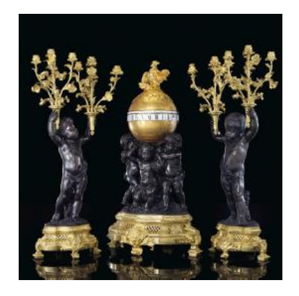
A FRENCH ORMOLU AND PATINATED-BRONZE THREE-PIECE CLOCK GARNITURE, 1881, BY HENRY DASSON $70,000-100,000