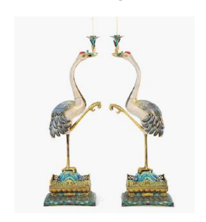
A VERY LARGE PAIR OF CHINESE CLOISONNE ENAMEL MODELS OF CRANES, 19TH CENTURY $40,000-60,000