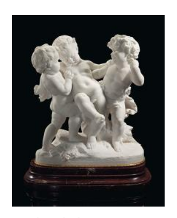
BENOÎT (BÉNÉDICT) ROUGELET (1834–1894) LE BACCHANAL; AND LA FÊTE $40,000–60,000