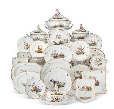
A LARGE MEISSEN PORCELAIN ORNITHOLOGICAL ASSEMBLED PART SERVICE LATE 18TH CENTURY, BLUE CROSSED SWORDS MARKS, MOST WITH STARS, SOME WITH DOTS $30,000-50,000