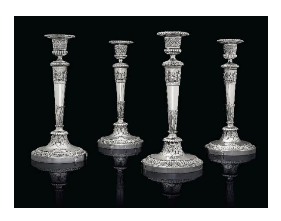
A SET OF FOUR GEORGE III SILVER CANDLESTICKS MARK OF PAUL STORR, LONDON, 1808 $80,000-120,000