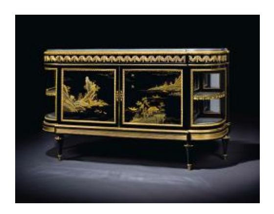
A PAIR OF FRENCH ORMOLU-MOUNTED JAPANESE LACQUER AND EBONIZED COMMODES A L'ANGLAIS, THIRD QUARTER 19TH CENTURY AFTER MARTIN CARLIN $120,000-180,000