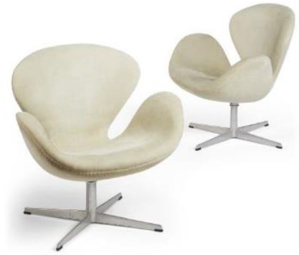
ARNE JACOBSEN (1902-1971)

The first painted in 1981; the second painted in 1983. $10,000-15,000