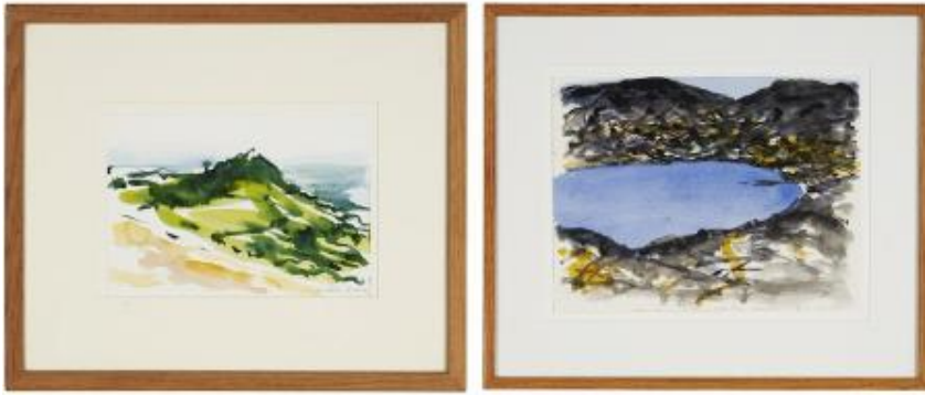
ELAINE DE KOONING (AMERICAN, 1918-1989)

Montepozio I and Villa Eden, Acapulco each watercolor on paper