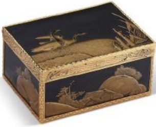
LOT 51 A LOUIS XV GOLD AND JAPANESE LACQUER SNUFF BOX THE MOUNTS PARIS, CIRCA 1747 $40,000-60,000