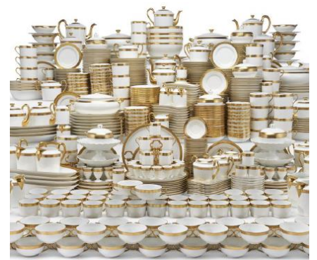
LOT 395 AN EXTENSIVE LIMOGES (RAYNAUD & CIE) PORCELAIN GILT-WHITE PART SERVICE 20TH CENTURY, GREEN-PRINTED AND GILT SWAN MARKS $6,000-10,000