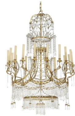
LOT 61 A PAIR OF NORTH EUROPEAN GILT-METAL AND CUT-GLASS EIGHTEEN-LIGHT CHANDELIERS IN THE MANNER WERNER UND MIETH, 19TH CENTURY $20,000-40,000