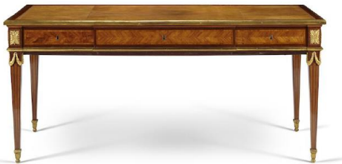
LOT 68 A LOUIS XVI ORMOLU-MOUNTED AMARANTH AND BOIS SATINE PARQUETRY BUREAU PLAT BY JEAN-FRANÇOIS LELEU, CIRCA 1775 $60,000-100,000