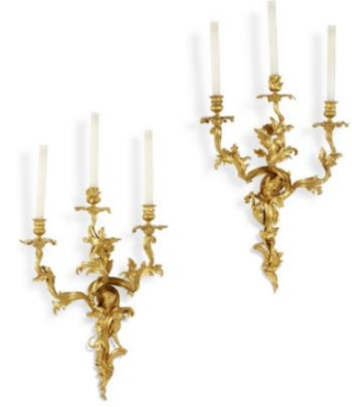
LOT 171 A PAIR OF LOUIS XV ORMOLU THREE-BRANCH WALL-LIGHTS MID-18TH CENTURY $30,000-50,000