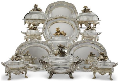
LOT 172 A FRENCH PARCEL-GILT SILVER AND SILVER-PLATE DINNER SERVICE MARK OF ODIOT, PARIS, AND CHRISTOFLE, PARIS, MID 19TH CENTURY $30,000-50,000