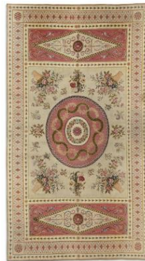
LOT 62 THE 'STRADBROKE' GEORGE III AXMINSTER CARPET POSSIBLY AFTER A DESIGN BY JAMES WYATT, ENGLAND, CIRCA 1790 $100,000-150,000