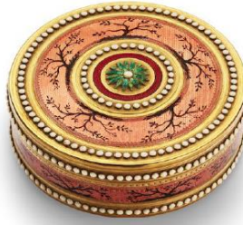
LOT 49 A LOUIS XVI GOLD AND ENAMEL BONBONNIÈRE MAKER'S MARK ?CM, PARIS, 1779 $6,000-8,000