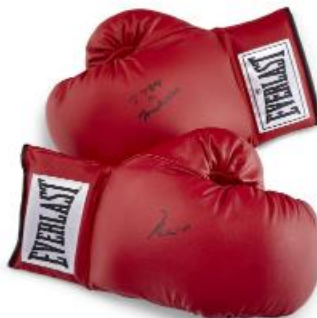
LOT 259 A PAIR OF BOXING GLOVES AUTOGRAPHED BY MUHAMMAD ALI $1,500-2,000