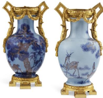
LOT 43 A PAIR OF LOUIS XVI ORMOLU- MOUNTED CHINESE BLUE-GROUND PORCELAIN VASES CIRCA 1770, THE PORCELAIN 18TH CENTURY $25,000-40,000