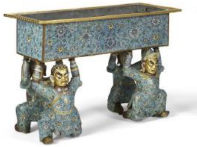
LOT 133 PAIR OF LARGE CHINESE CLOISSONNÉ ENAMEL CENSERS LATE 18TH- EARLY 19TH CENTURY $30,000-50,000