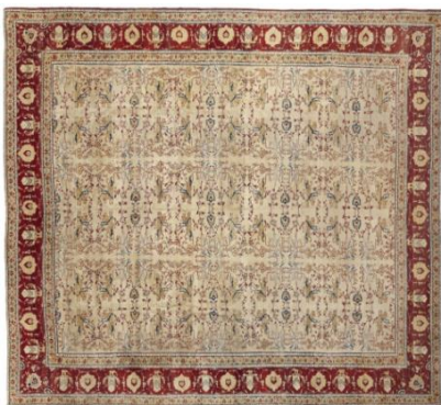
LOT 403 AN AGRA CARPET NORTH INDIA, LAST QUARTER 19TH CENTURY $40,000-60,000