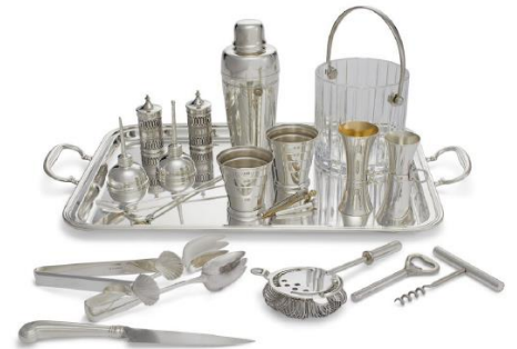
LOT 269 AN ASSEMBLED SILVER BAR SERVICE MOST MARK OF TIFFANY & CO., SECOND HALF 20TH CENTURY $2,500-3,500