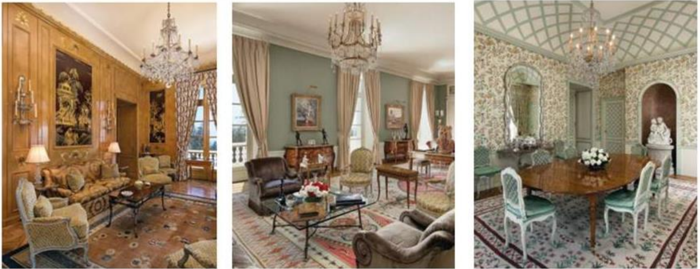
Left to right: The Garden Room, The Salon and The Morning Room

PROCEEDS TO BENEFIT THE PERENCHIO FOUNDATION