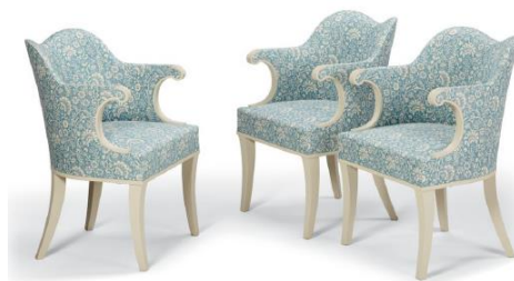
LOT 327 HENRI SAMUEL (1904-1996) A SET OF THREE FRENCH WHITE-PAINTED ARMCHAIRS, CIRCA 1990 $1,000-1,500