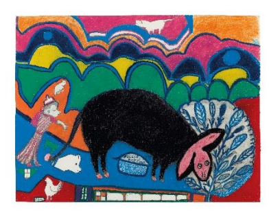
NELLIE MAE ROWE (1900–1982) Animals and Hills, 1981 crayon on paper 18 x 23½ in. Estimate: $4,000-8,000