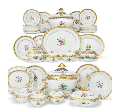
A LARGE FAMILLE ROSE AND GILT DINNER SERVICE CIRCA 1800 Estimate: $15,000-25,000

like an oxhead tureen and cover (estimate: $40,000-60,000), and a pair of goose tureens and covers (estimate: $125,000-175,000). Part II of the Eckenhoff Collection of Chinese Porcelain Mugs will also be offered, with rare European subject mugs and armorial examples as well as famille verte and famille rose. Other notable offerings include private collections of 'Pronk' porcelain and of European subject rarities and a small selection of China trade paintings. The sale also includes works with Illustrious Provenance from the Rockefeller Family: Property from the Collection of Abby and George O'Neill featuring a pair of Famille Verte Biscuit-Glazed Piggyback Boys from the Kangxi period (estimate: $5,000-8,000), and a rare pair of Partridge Sauce Tureens and Covers from the Qianlong period (estimate: $6,000-10,000).