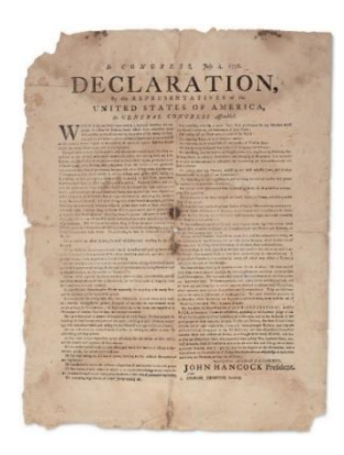
DECLARATION OF INDEPENDENCE – In Congress, July 4, 1776. A rare contemporary broadside edition of the Declaration of Independence. Estimate: $600,000 – 800,000

The silver section encompasses works from the late 17th century through the 20th century, highlighted by The Governor Gurdon Saltonstall Basin, an Important American Silver Basin by Jeremiah Dummer (estimate: $30,000-50,000) and an 1876 Philadelphia Centennial International Exhibition: A Monumental American Silver-Plated Centerpiece Epergne (estimate: $10,000-20,000). A selection of Tiffany is led by a set of 12 American 18-Karat after dinner coffee cups, saucers and spoons and an American silver and mixed-metal vase (estimate: $10,000-15,000). The section is further anchored by the collection of Mary M. and Robert M. Montgomery Jr. which includes eight lots of Gorham silver from their Art Nouveau Martelé line.