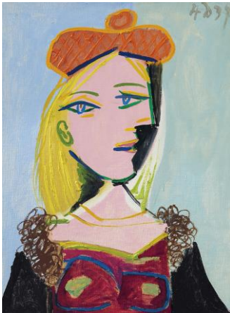
Pablo Picasso Femme au béret orange et au col de fourrure (Marie-Thérèse) 4 December 1937, oil on canvas $15,000,000 – 20,000,000

"I paint the way some people write their autobiography." – Pablo Picasso