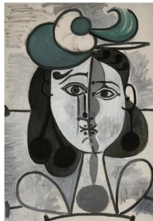
Pablo Picasso Portrait de Françoise Gilot Painted between 2 May 1947 and 26 December 1948, oil on canvas $3,000,000-5,000,000