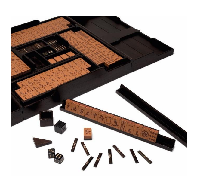
A PALISSANDER WOOD HELIOS MAHJONG SET