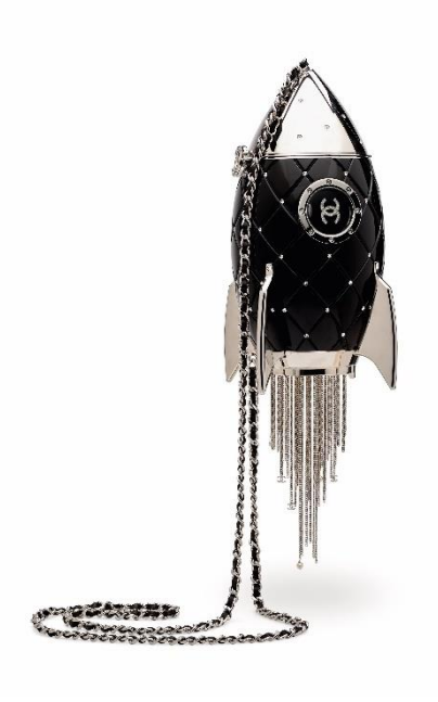
A RUNWAY BLACK LUCITE & CRYSTAL ROCKET SHIP EVENING BAG