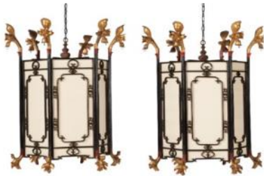
A PAIR OF CHINESE HEXAGONAL LACQUERED AND GILTWOOD LANTERNS LATE QING DYNASTY - REPUBLIC PERIOD, 19TH-20TH CENTURY ESTIMATE: $3,000-5,000 PRICE REALIZED $47,880

Jewelry & Handbags achieved a total of $1,065,204, selling 331.27% hammer by low estimate. The sale was led by a shiny vert Foncé porosus Crocodile Birkin 35 with gold hardware, by Hermès, which sold for $60,480, more than seven times its low estimate. Notable results were also achieved by a matte Béton Niloticus Crocodile Birkin 30 with gold hardware, by Hermès, which sold for $44,100, seven times its low estimate and an Hermès Matte Marron Foncé Niloticus Crocodile Birkin 30 with Palladium Hardware, which sold for $40,320, five times its low estimate. A group of three dresses and five handbags created by Oscar de la Renta incorporating textiles from Mrs. Getty's personal collection sold for more than three times its low estimate to realize a total of $62,118, with proceeds donated to the University of San Francisco for the benefit of the Ann Getty Institute of Art & Design.