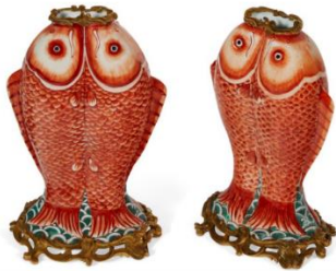
A PAIR OF FRENCH ORMOLU-MOUNTED CHINESE PORCELAIN TWIN FISH VASES THE PORCELAIN QIANLONG (1735-1796), THE MOUNTS LAST QUARTER 19TH CENTURY ESTIMATE: $5,000-8,000 PRICE REALIZED $37,800

The Art of the Table: Ceramics, Silver, and Table Decorations achieved a total of $1,996,722, selling 331.27% hammer by low estimate. The sale was led by a French (Limoges) Porcelain Harlequin Part Service early 20th Century, which sold for $214,200, fifty-three times its low estimate. Notable results were also achieved by an Assembled French (Le Tallec) Porcelain Part Dinner Service, 20th Century, which sold for $163,800, thirty-two times its low estimate and an Extensive American Silver-Gilt Flatware Service, Tiffany & Co., New York, 20th Century, which sold for $113,400, nearly 10 times its low estimate.