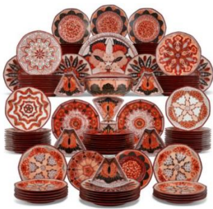
A FRENCH (LIMOGES) PORCELAIN HARLEQUIN PART SERVICE EARLY 20TH CENTURY ESTIMATE: $4,000-6,000 PRICE REALIZED $214,200

Indian, Ottoman, Global Works of Art, Jewelry & Textiles achieved a total of $2,988,972, selling 428.81% hammer above the low estimate. The sale was led by a pair of Mother-of-Pearl Inlaid Doors, 19 th Century, which sold for $693,000. Notable results were also achieved by an illustration of a Ruler Entertained in an Encampment which sold for $100,800, twenty times its low estimate as well Mrs. Getty's collection of Indian jewellery and textiles.