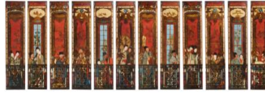
A SET OF TWELVE GERMAN PAINTED PANELS circa 1720

Vol. 2 | Old Master, 19th and 20th Century Paintings, Day Sale