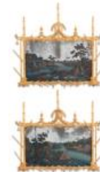
A PAIR OF CHINESE EXPORT REVERSE-PAINTED MIRRORS IN GEORGE III GILTWOOD FRAMES THE MIRRORS QING DYNASTY circa 1760 Estimate: $50,000-80,000 Price Realized: $327,600

Vol. 4 | Chinese Works of Art, English and European Furniture and Decorative Arts, Day Sale