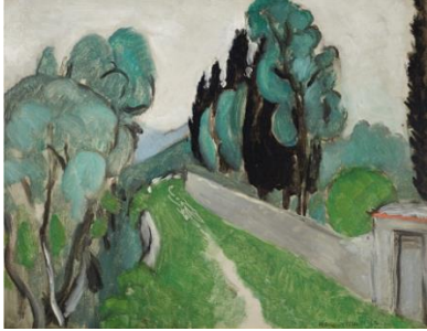
HENRI MATISSE (1869-1954) Paysage avec cyprès et oliviers aux environs de Nice

Estimate: $150,000-250,000 Price Realized: $2,220,000