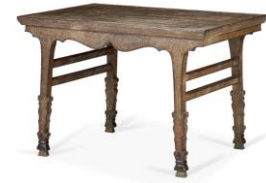
A VERY RARE MOTHER-OF-PEARL-INLAID BLACK LACQUER SOFTWOOD RECESSED-LEG WINE TABLE, JIUZHUO MING DYNASTY, WANLI PERIOD (1572-1620)

Vol. 3 | English and European Furniture, Porcelain and Silver, Day Sale