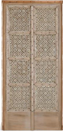
A PAIR OF MOTHER-OF-PEARL INLAID DOORS INDIA, GUJARAT, EARLY 19TH CENTURY ESTIMATE: $8,000-12,000 PRICE REALIZED $693,000