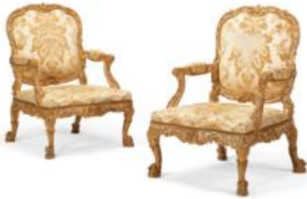
A Pair Of George II White-Painted and Parcel-Gilt Armchairs

Estimate: $100,000-150,000 Price Realized: $630,000 Vol. 4 | Chinese Works of Art, English and European Furniture and Decorative Arts, Day Sale