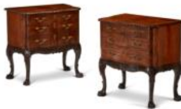
A PAIR OF GEORGE II MAHOGANY SERPENTINE COMMODES

Vol. 4 | Chinese Works of Art, English and European Furniture and Decorative Arts, Day Sale