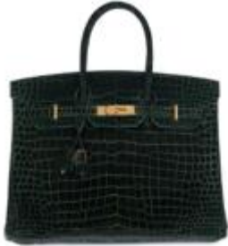
A SHINY VERT FONCÉ POROSUS CROCODILE BIRKIN 35 WITH GOLD HARDWARE HERMÈS, 2005 ESTIMATE: $8,000-10,000 PRICE REALIZED $60,480