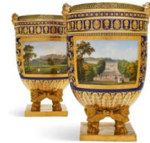
A PAIR OF SILVER-GILT MOUNTED SEVRES PORCELAIN BEAU BLEU GROUND ICE PAILS FROM THE 'SERVICE A VUES DIVERSES' COMMISSIONED BY NAPOLEON BONAPARTE DELIVERED TO LOUIS XVIII Estimate: $80,000-120,000 Price Realized: $214,200 Vol. 1 | Important Pictures and Decorative Arts, Evening Sale

Vol. 1 | Important Pictures and Decorative Arts, Evening Sale