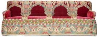
A LATE VICTORIAN MAHOGANY SOFA 19TH CENTURY ESTIMATE: $8,000-12,000 PRICE REALIZED: $214,200