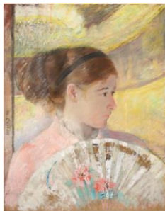
MARY CASSATT (1844-1926) Young Lady in a Loge Gazing to Right Estimate: $3,000,000-5,000,000 Price Realized: $7,489,000 Vol. 1 | Important Pictures and Decorative Arts, Evening Sale