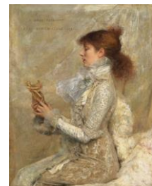
JULES BASTIEN-LEPAGE (1848-1884) Portrait de Sarah Bernhardt Estimate: $500,000-800,000 Price Realized: $2,280,000 Vol. 1 | Important Pictures and Decorative Arts, Evening Sale