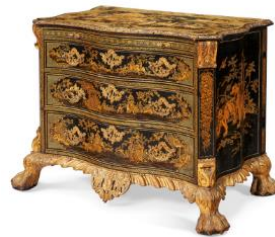
A GEORGE II BLACK AND GREEN GILT-JAPANNED AND PARCEL-GILT CHEST OF DRAWERS

Vol. 1 | Important Pictures and Decorative Arts, Evening Sale