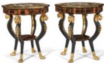
A PAIR OF REGENCY CALAMANDER, EBONIZED AND PARCEL-GILT OCTAGONAL TABLES WITH ITALIAN SPECIMEN MARBLE TOPS

circa 1810 Estimate: $80,000-120,000 Price Realized: $428,400