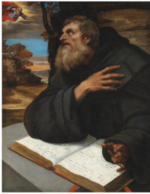
SEBASTIANO LUCIANI, CALLED SEBASTIANO DEL PIOMBO (VENICE C. 1485–1547 ROME) The Vision of Saint Anthony Abbot oil on canvas Price Realized: $3,150,000