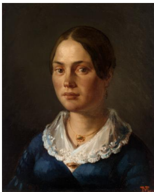
JEAN-FRANÇOIS MILLET (FRENCH, 1814-1875) Portrait of Madame Martin Price Realized: $625,000