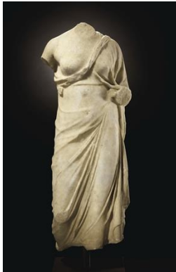
A ROMAN MARBLE HYGEIA CIRCA LATE 1ST CENTURY B.C.-EARLY 1ST CENTURY A.D. Price Realized: $325,000