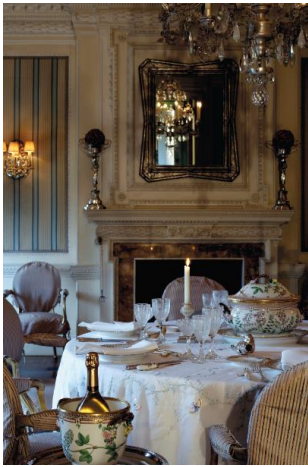
The dining room set with the Flora Danica part dinner service