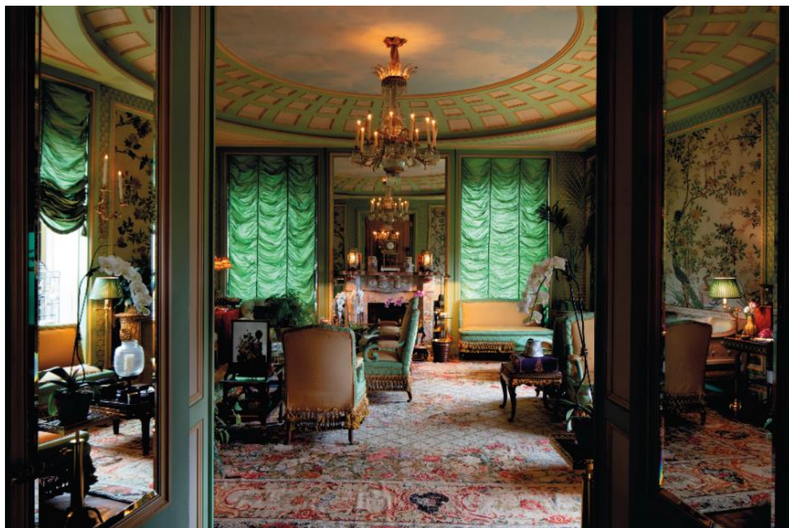
The Winter Garden at 834 Fifth Avenue

Live Auction 26–27 January Online Auctions 14–29 January