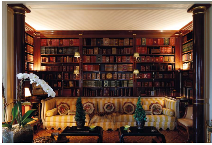
The salon alcove with a massive Louis XVI grey-painted canape by Jean-Baptiste Lelarge