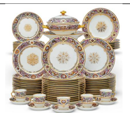
AN ASSEMBLED SEVRES (OUTSIDE-DECORATED) AND SEVRES STYLE PORCELAIN PART DINNER SERVICE 19th/20th Century, Spurious Printed Marks $5,000-7,000

The Private Collection of Jayne Wrightsman: Online Online 1 - 15 October