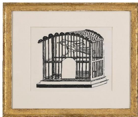
The Art of Literature: Loan and Selling Exhibition Lucian Freud (1922-2011) Bird in a Cage Executed in 1946 ON LOAN