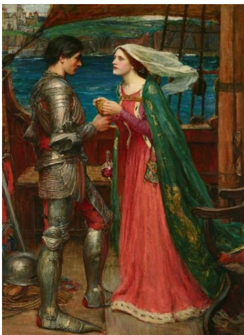
The Art of Literature: Loan and Selling Exhibition John William Waterhouse, R.A. (1849–1917) Tristram and Isolde Painted in 1916 Price on request

London - Christie's announces The Art of Literature , part of London Now , an exhibition showcasing a selection of artistic masterpieces inspired by literature through the ages. From