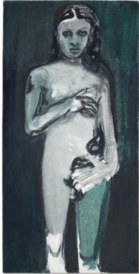
The Art of Literature: Loan and Selling Exhibition Marlene Dumas (b. 1953) Magdalena (Venus) Painted in 1995 ON LOAN