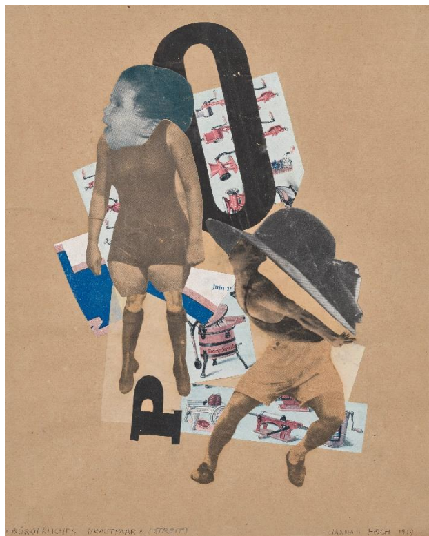
Ernst Ludwig Kirchner Sonnentänzerin (1933-35, price realised: £781,200) Hannah Höch, Bürgerliches Brautpaar (Streit) (1919, price realised: £264,600)

London – Christie's Impressionist and Modern Art Day and Works on Paper Sale achieved a total of £16,878,456 / $21,587,545 / €19,714,037, with strong sell-through rates of 92% by value and 88% by lot. This brings the running total for the 20/21 March season to £213,564,056 / $271,968,314 / €249,049,446.