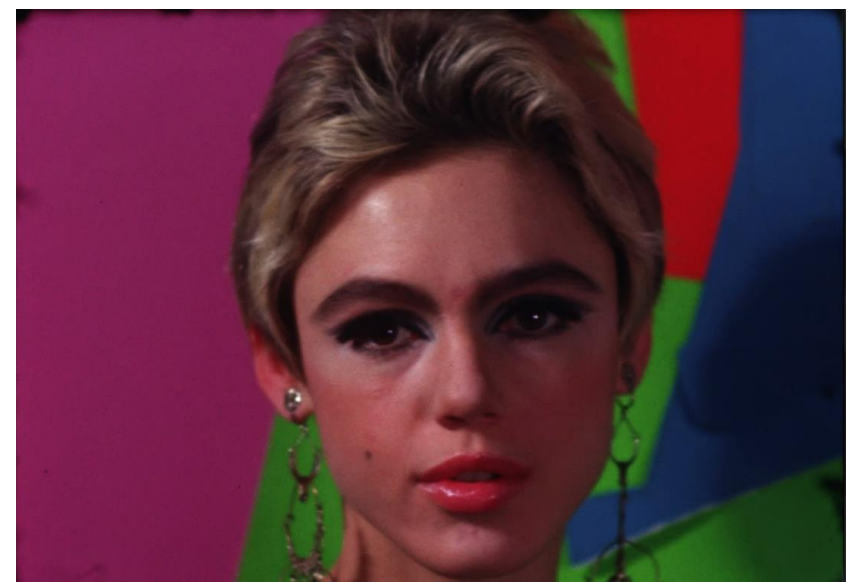
Andy Warhol, Edie Sedgwick [ST312], 1965 16mm film, color, silent, 4.4 minutes at 16 frames per second © The Andy Warhol Museum, Pittsburgh, PA, a museum of Carnegie Institute. All rights reserved. Film still courtesy The Andy Warhol Museum

Los Angeles – Christie's is pleased to announce Andy Warhol Screen Tests , a special exhibition presented together with The Andy Warhol Museum featuring a curated selection of eight silent films in Christie's Beverly Hills galleries. The exhibition opens during Frieze Week in Los Angeles, running Tuesday, February 27 – Thursday, March 14. Both film and art, the works in this exhibition collectively offer a rare glimpse into the intersection of portraiture, celebrity, and Hollywood that fascinated Andy Warhol in the 1960s, and famously came to define much of his practice. Notable figures portrayed in the works on view include 20<sup>th</sup> century icons Dennis Hopper, Bob Dylan, Edie Segwick, and more.