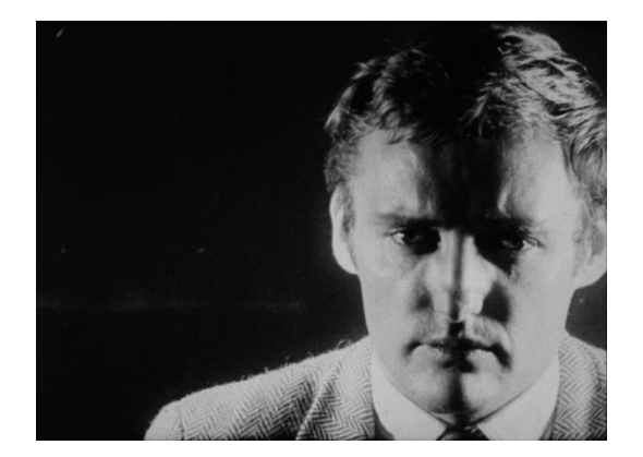
Andy Warhol, Lou Reed (Coke) [ST269], 1966 16mm film, black-and-white, silent, 4.5 minutes at 16 frames per second © The Andy Warhol Museum, Pittsburgh, PA, a museum of Carnegie Institute. All rights reserved. Film still courtesy The Andy Warhol Museum

Andy Warhol, Dennis Hopper [ST155], 1964 16mm film, black-and-white, silent, 4.3 minutes at 16 frames per second © The Andy Warhol Museum, Pittsburgh, PA, a museum of Carnegie Institute. All rights reserved. Film still courtesy The Andy Warhol Museum